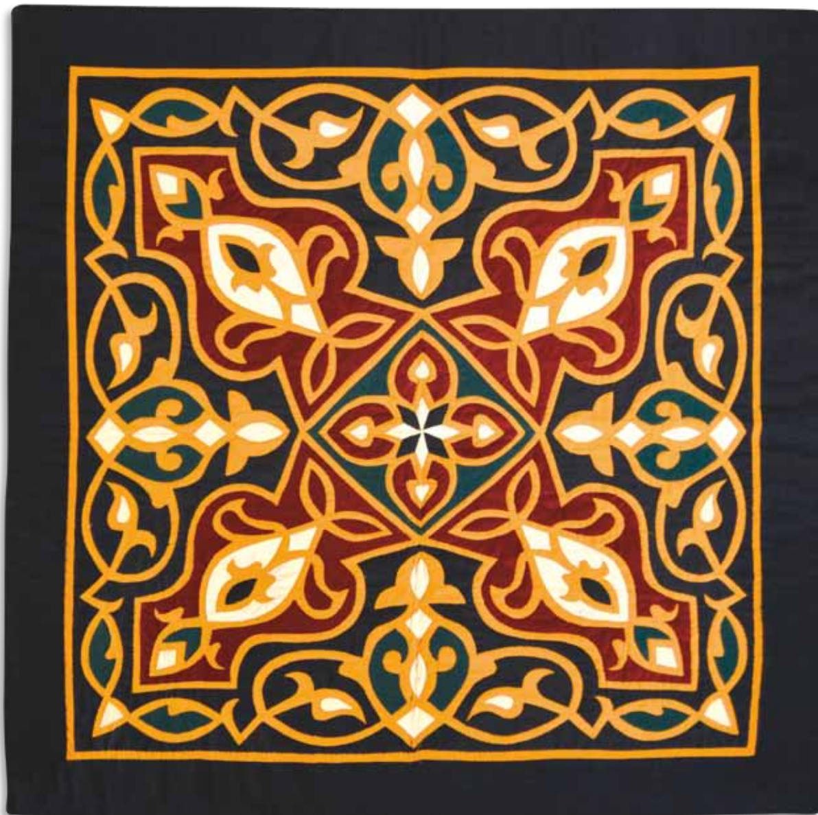
KHA90-9 Arabic wall hanging 90*90 cm – cotton face, linen back