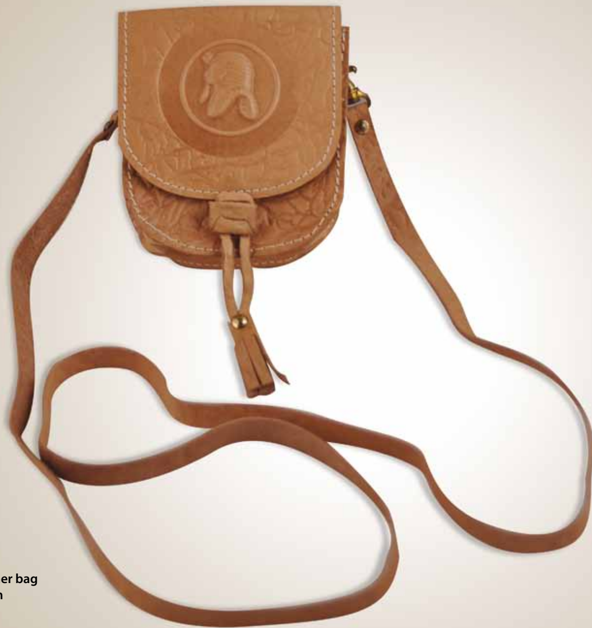
LTH-36R Carved Leather bag length: 15 cm Width: 8 cm