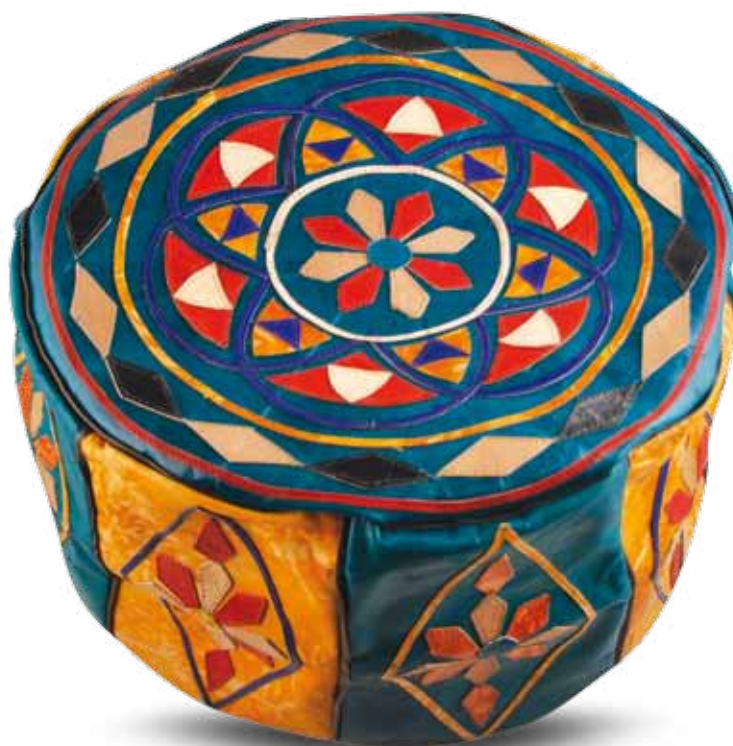
LTH-33L Leather floor cushion Diameter: 40 cm Height: 11 cm