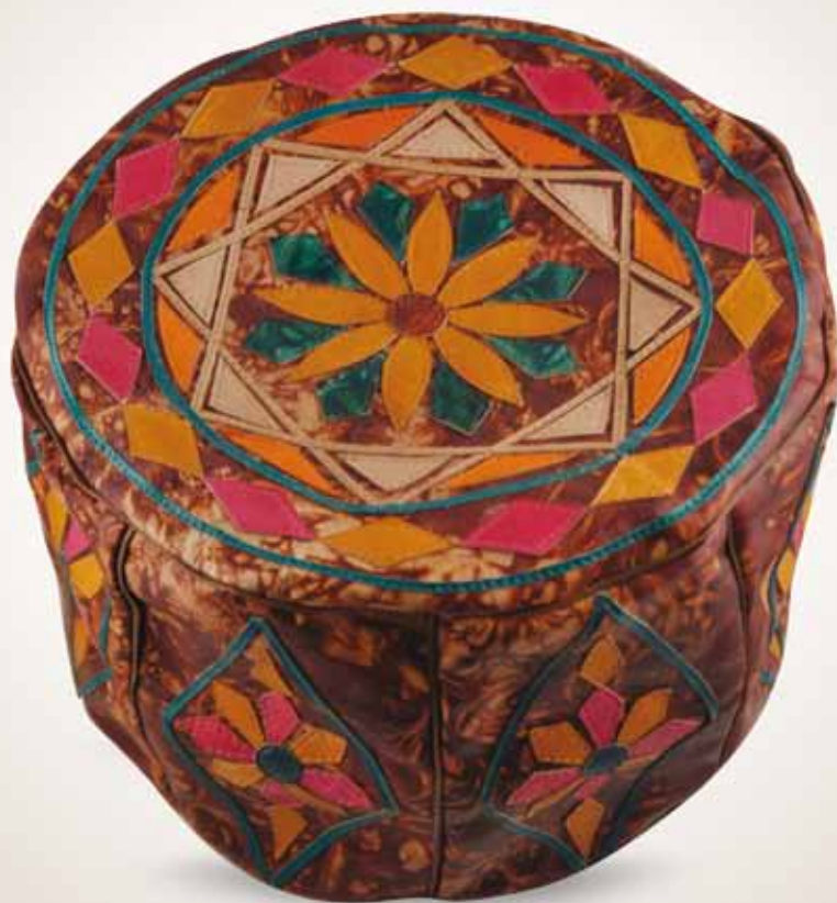
LTH-32R Leather floor cushions Diameter 40 cm Height 11 cm