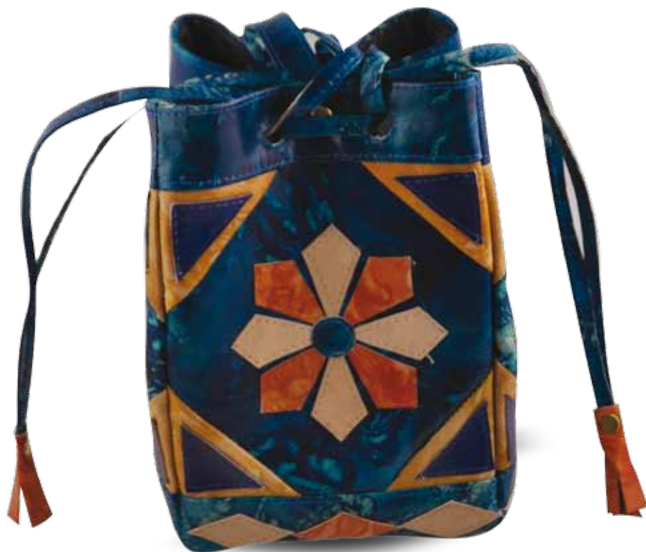
LTH-35L Ornamented leather bag Length: 15 cm Width: 10 cm Height: 20 cm