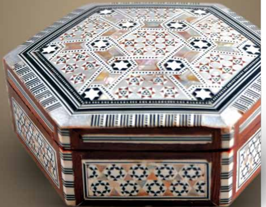
MOP-39B Hexagonal box Diameter: 10.5 cm Height: 4 cm Wood decorated with mother of pearl