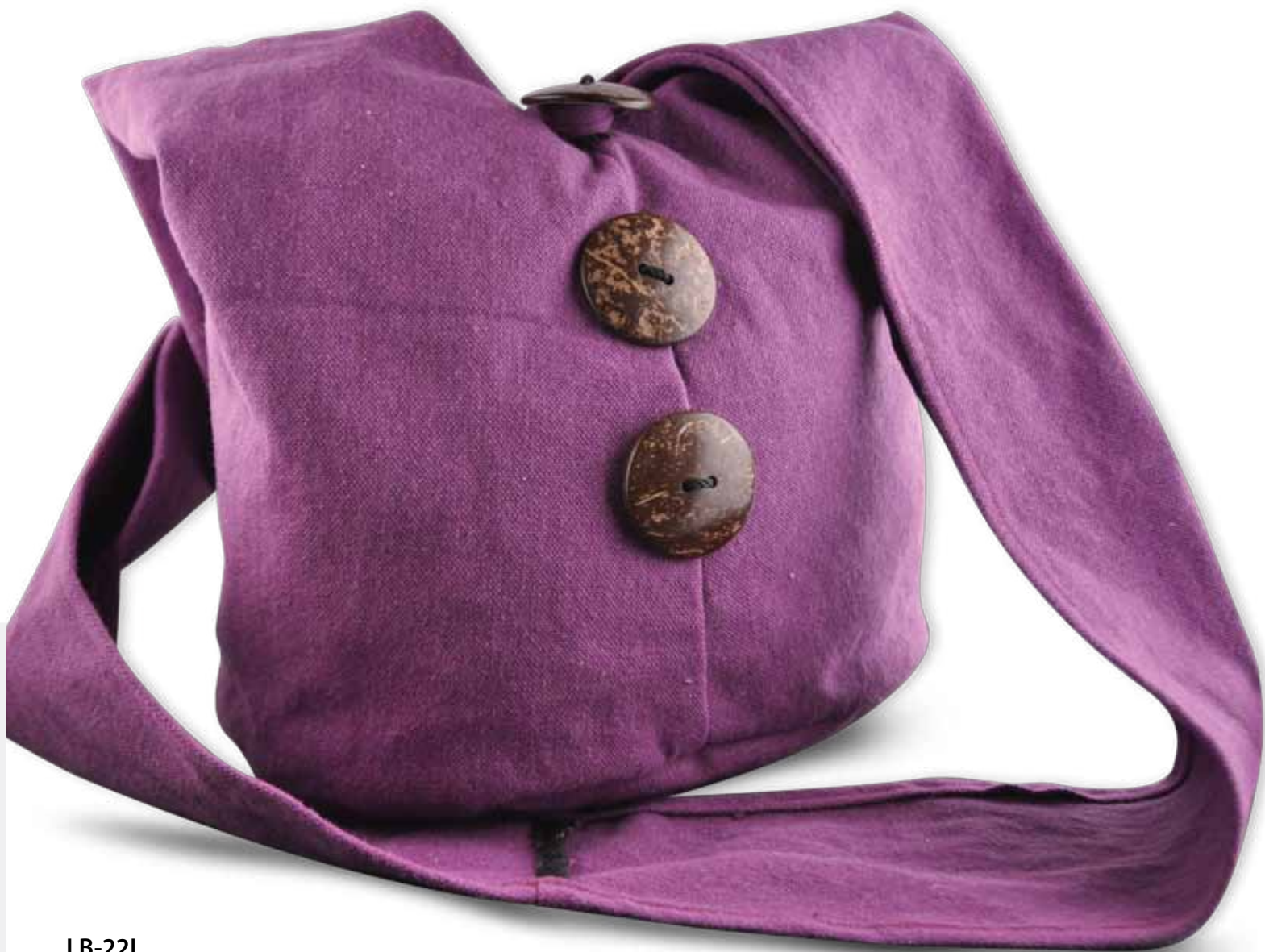
LB-22L Linen handmade bag 45*35 cm, Handle: 35 cm