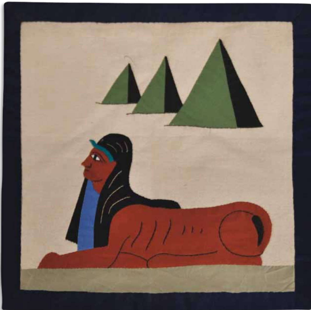
KHP90-10 Pharaonic wall hanging 90*90 cm – cotton face, linen back