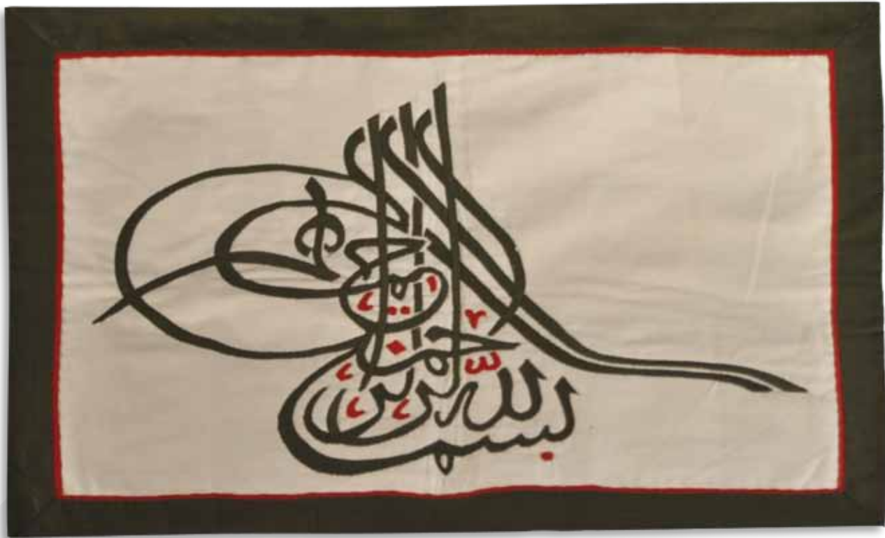
KHI70-11 Islamic wall hanging / cushion 45* 70 cm – cotton face , linen back