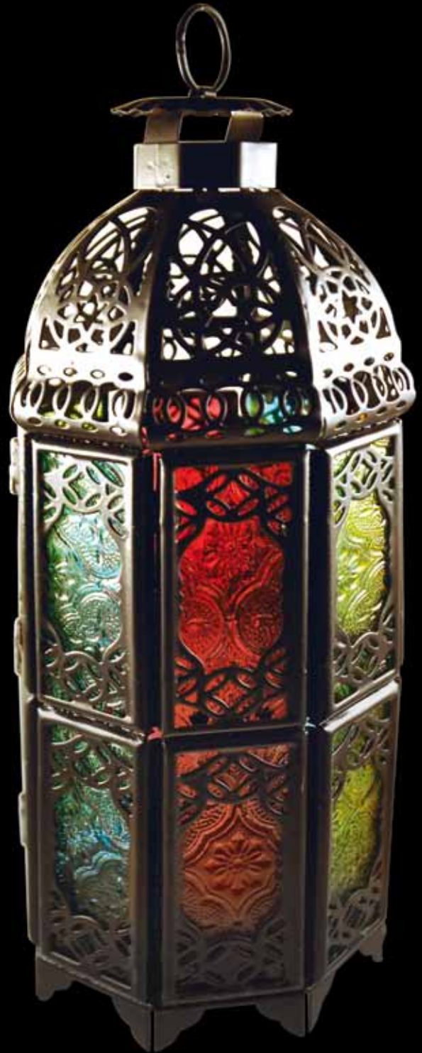
LO26 Octagonal lantern two doors height: 20.5 cm Base diameter: 9.5 cm Copper and glass