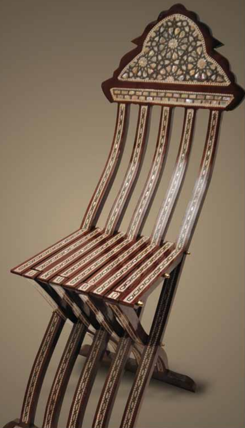
MOP-40 CH Foldable chair Height: 90 cm Setting area: 40*40 cm Wood decorated with mother of pearl