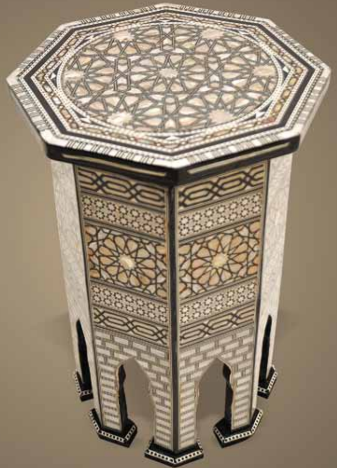
MOP-41HT Hexagonal table Diameter of the top: 35 cm Height: 50 cm