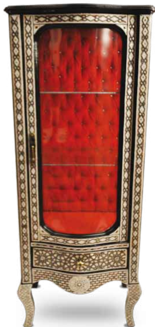
MOP-41CA China cabinet 2 m* 70 cm Mother of pearl decorated wood and glass