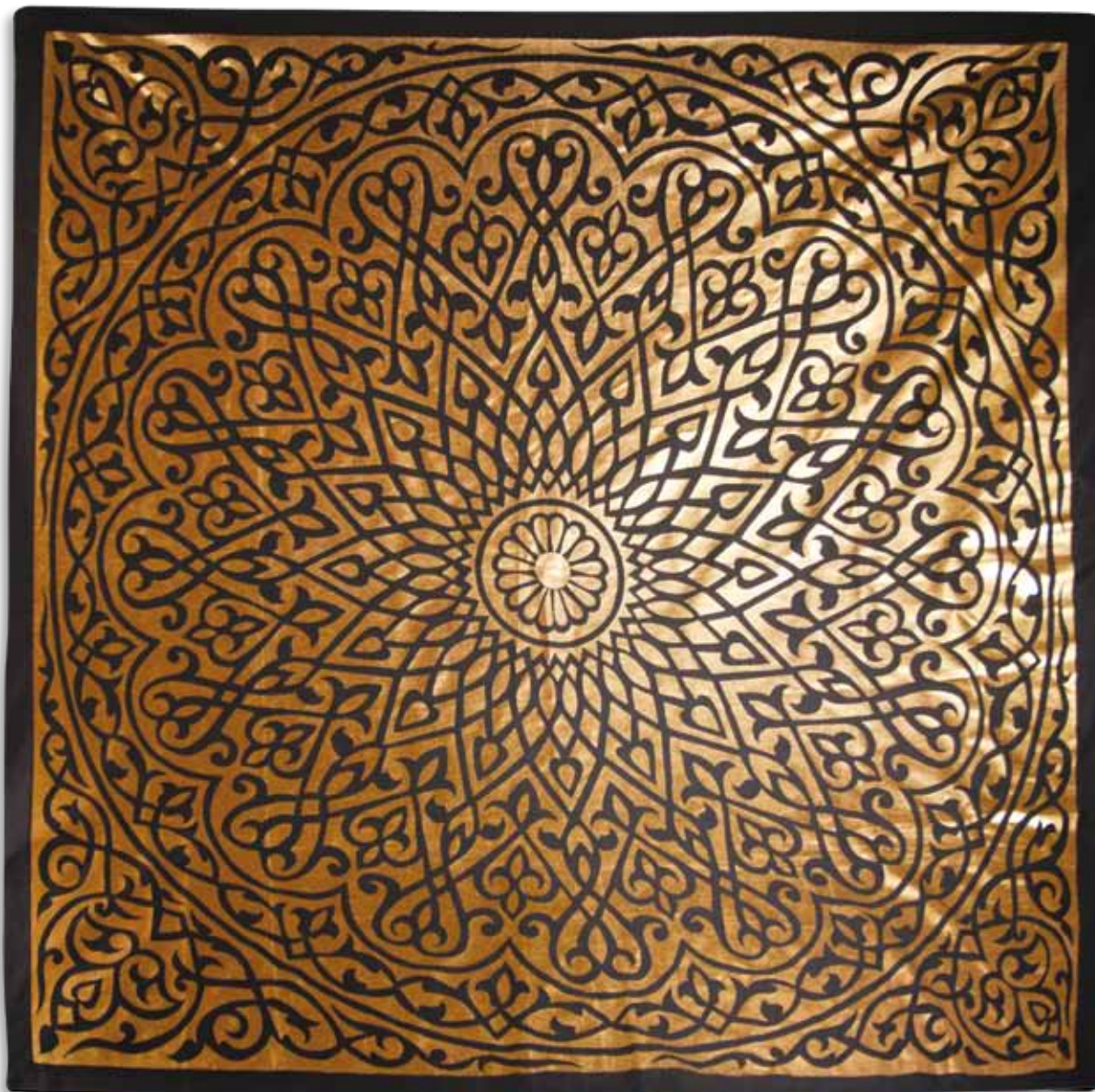
KHA110-11 Arabic wall hanging 110*110 cm – cotton face, linen back