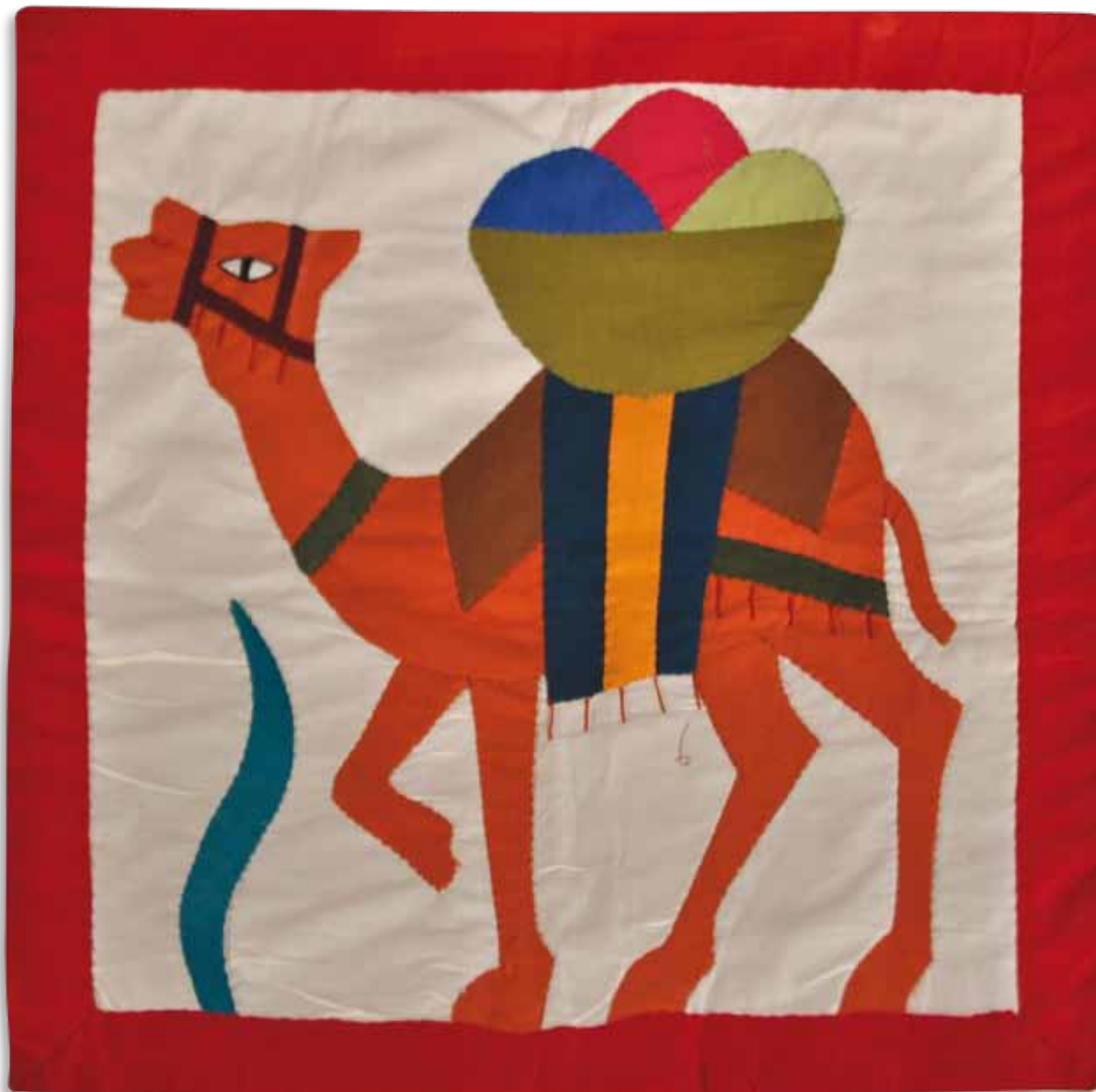
KHB90-10 Bedouin wall hanging 90*90 cm – cotton face, linen back