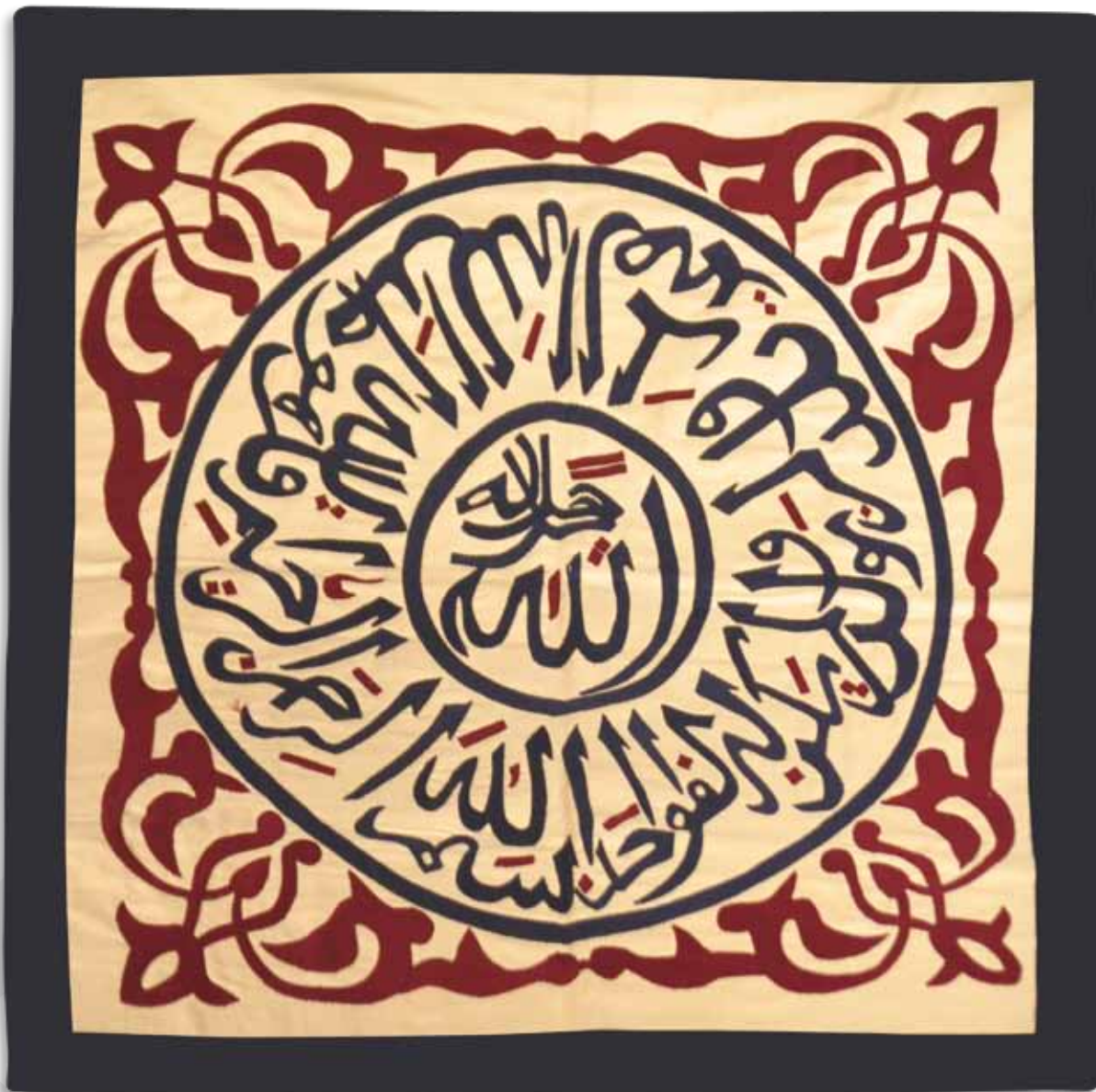
KHL90-7 Islamic wall hanging 90 * 90 cm - cotton face, linen back