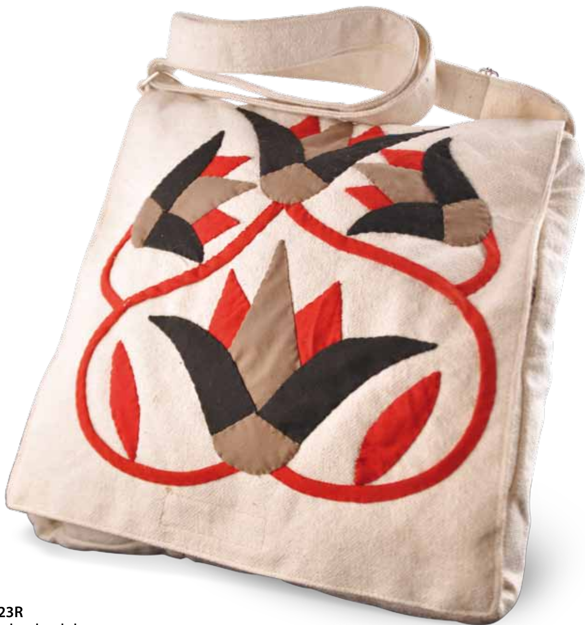
LB-23R Linen handmade bag 45*35 cm, Handle: 35 cm