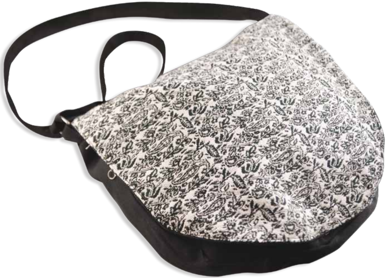
LB-22R Linen handmade bag 35*25 cm, Handle: 30 cm