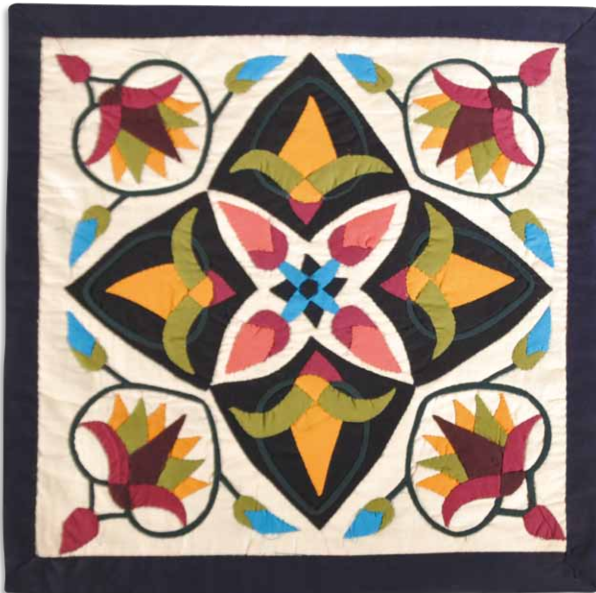
KHA45-8 Lotus cushion 45 * 45 cm - cotton