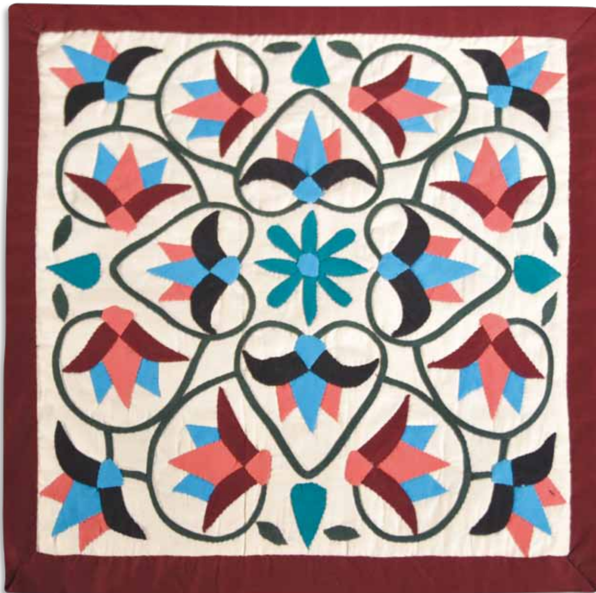
KHL90-12 Lotus wall hanging 90*90 cm – cotton face, linen back