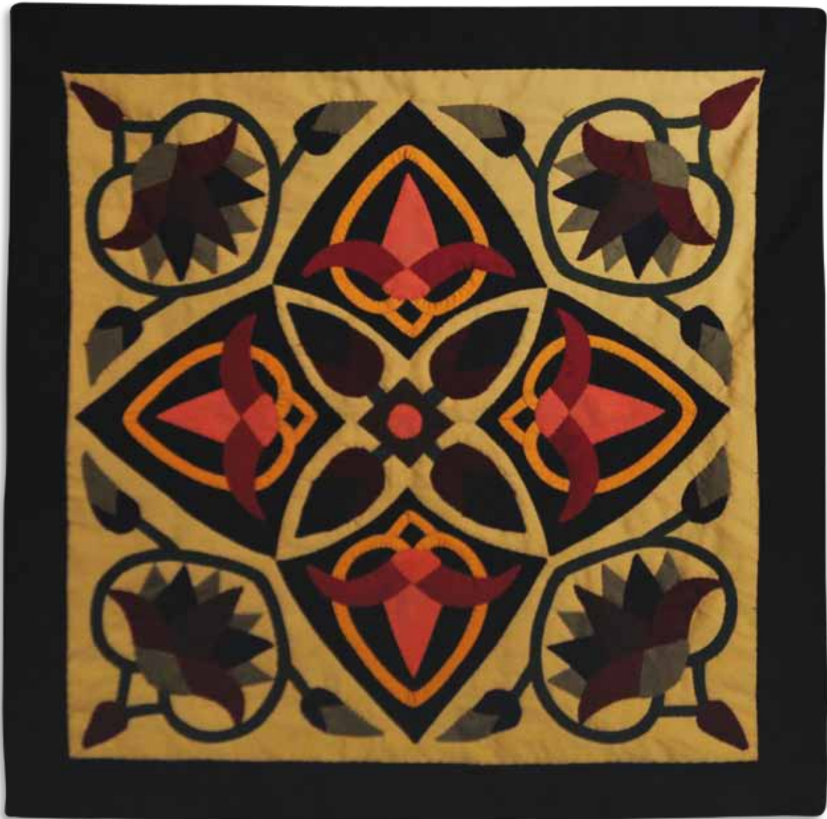
KHA45-6 Lotus cushion 45 * 45 cm - cotton