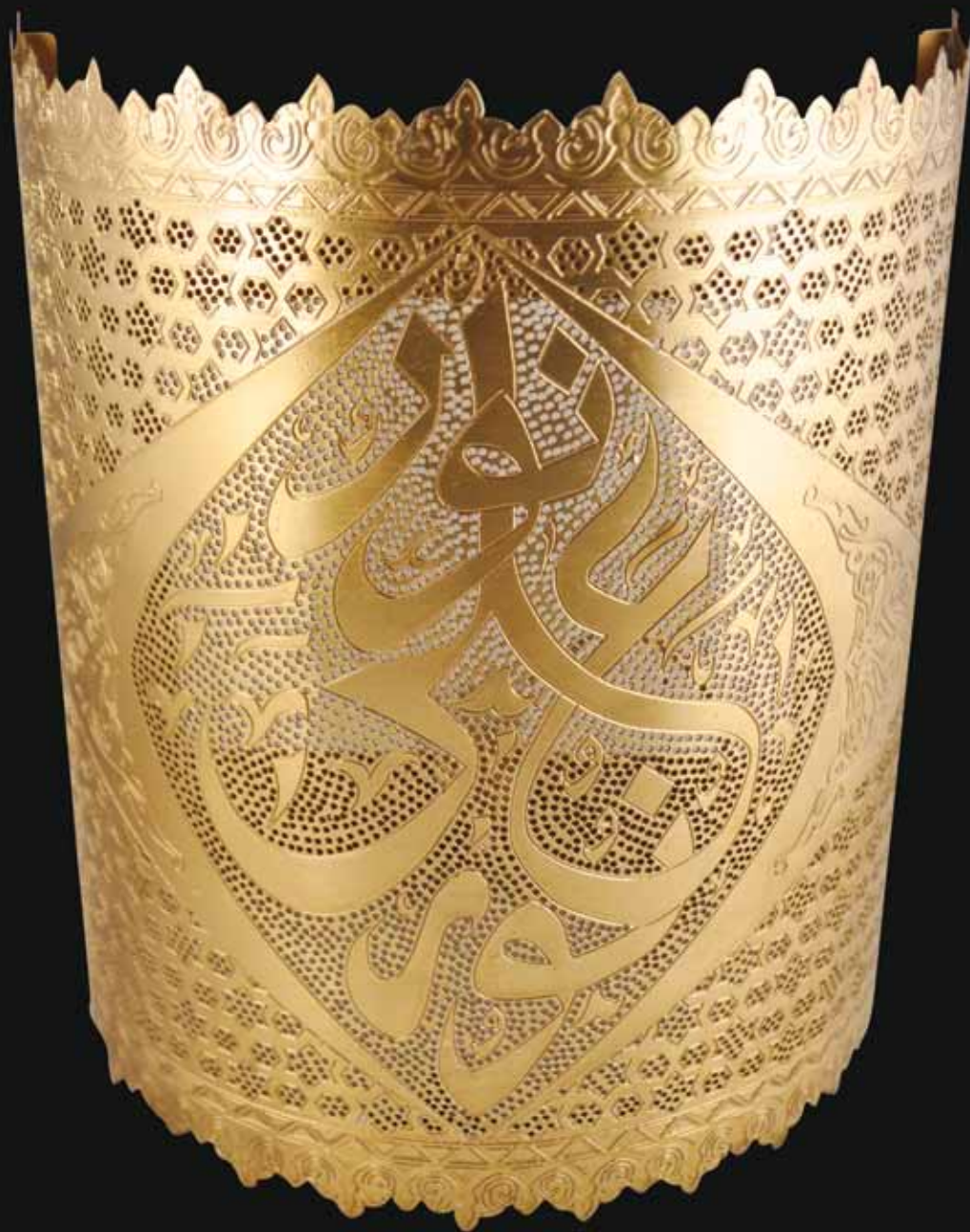
LS30 Semi circle wall lightening unit Height: 27 cm Width: 11 cm Copper