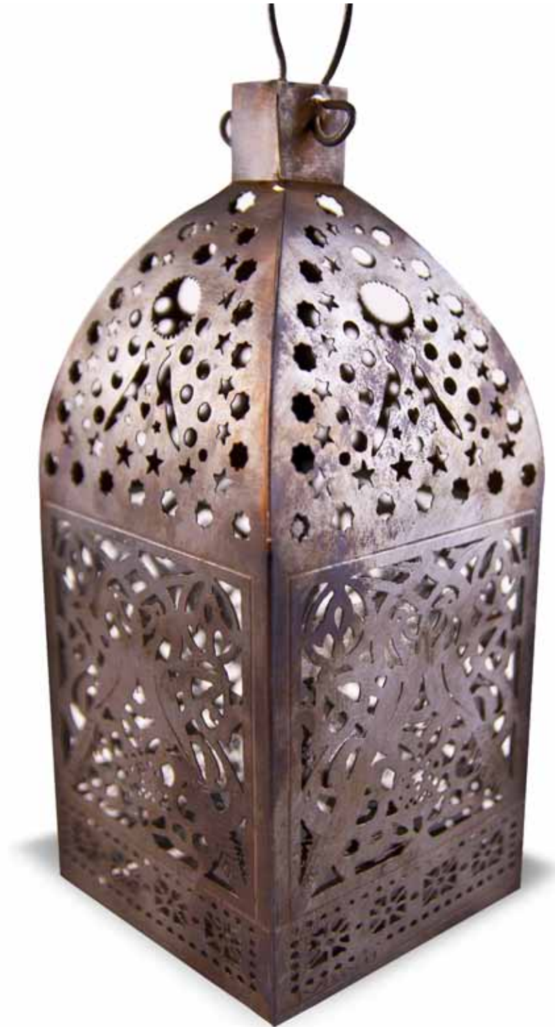
LR29 Rectangle lantern Height: 27 cm Base width: 7.5 * 7.5 cm Copper