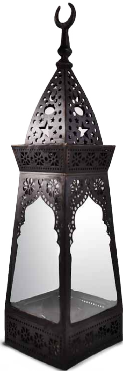
LT 25 Tower lantern Height: 27 cm Base width: 6.5 cm Copper and glass