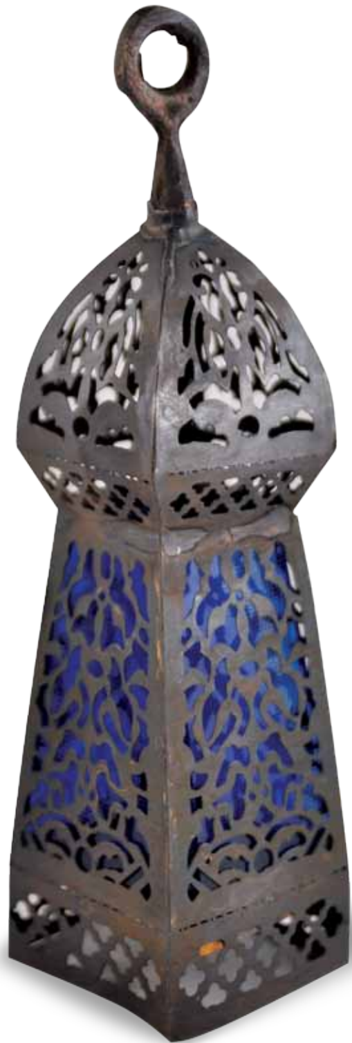
LT28 Tower lantern Height: 32 cm Base width: 8 cm Copper and glass