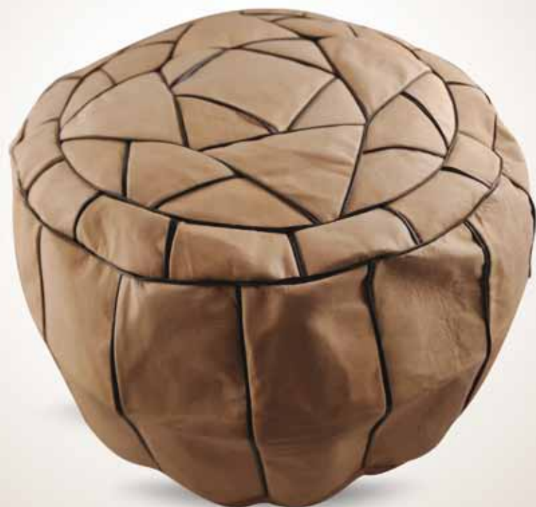
LTH-33R Leather floor cushion Diameter: 40 cm Height: 11 cm