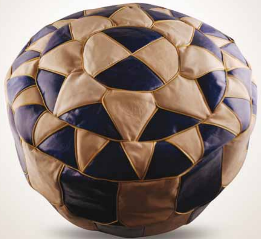
LTH-34R Leather floor cushion Diameter: 40 cm Height: 11 cm