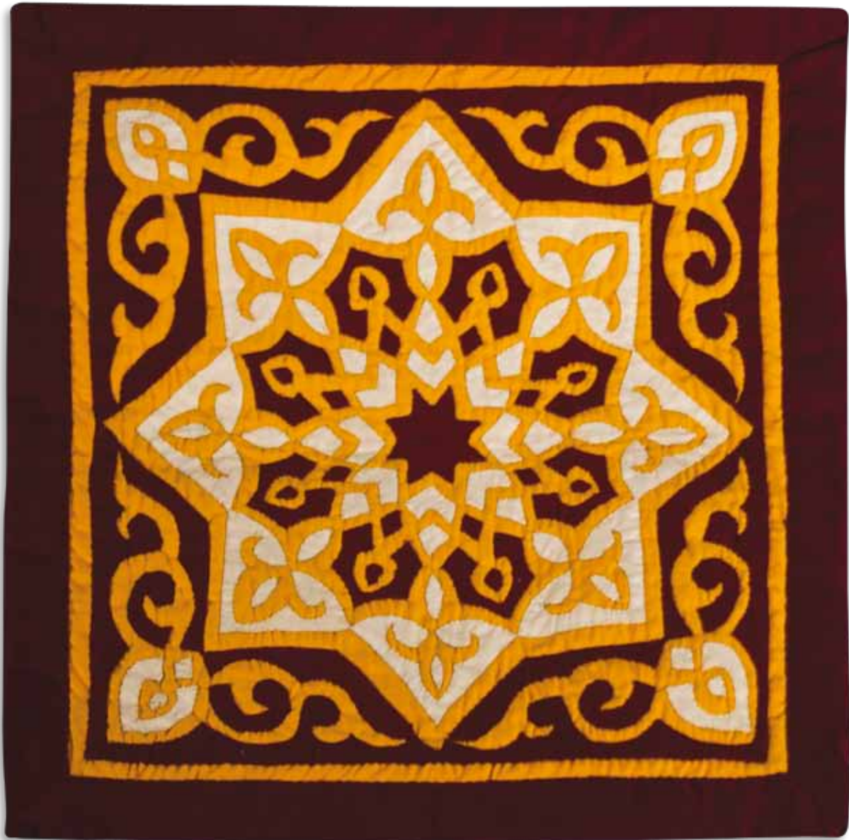
KHL90-7 Arabic wall hanging 90 * 90 cm - cotton face, linen back