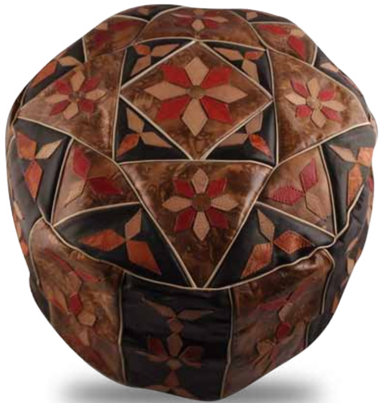
LTH-34L Leather floor cushion Diameter: 40 cm Height: 11 cm