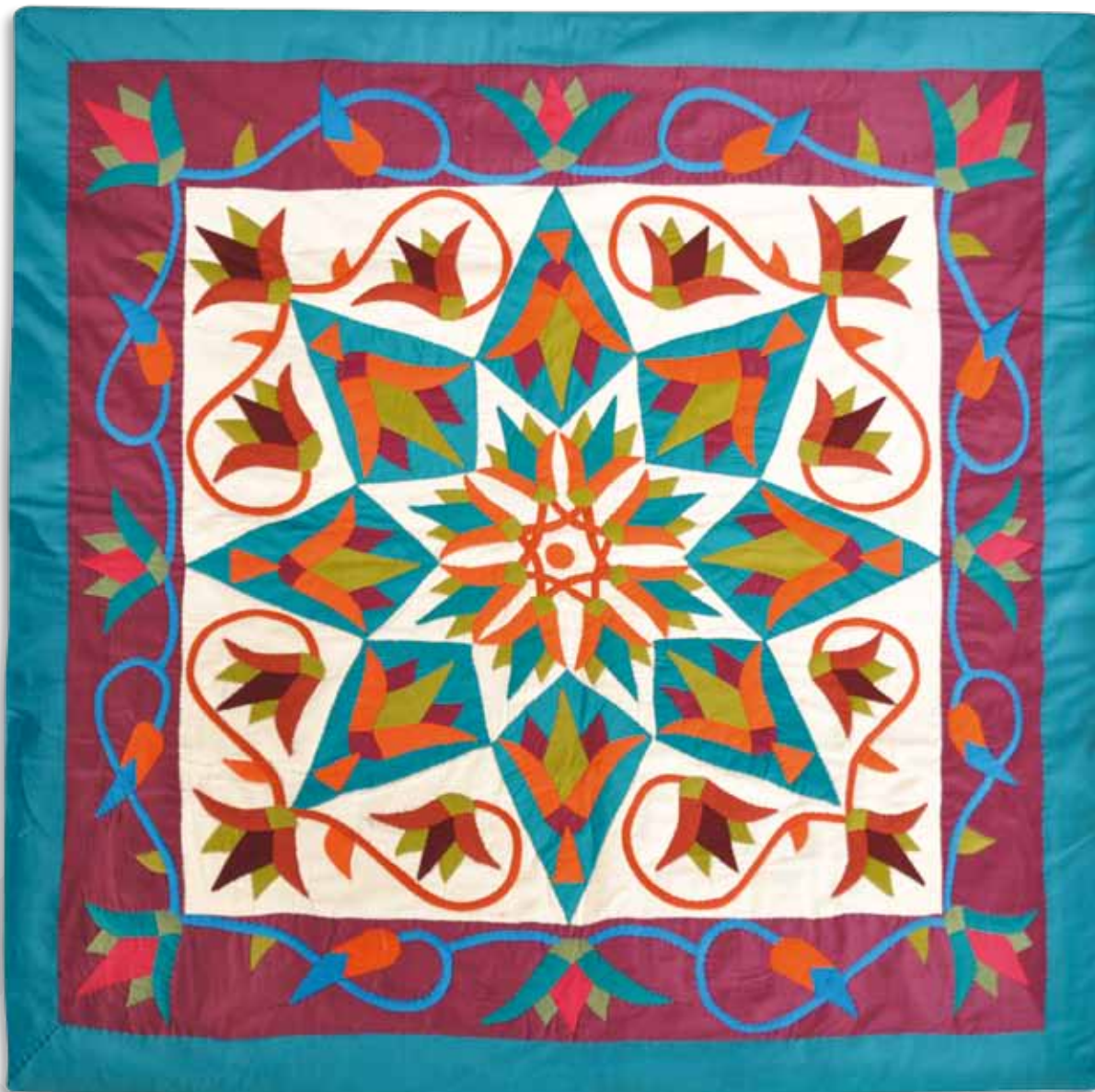
KHL110-19 Lotus wall hanging 110*110 cm – cotton face, linen back