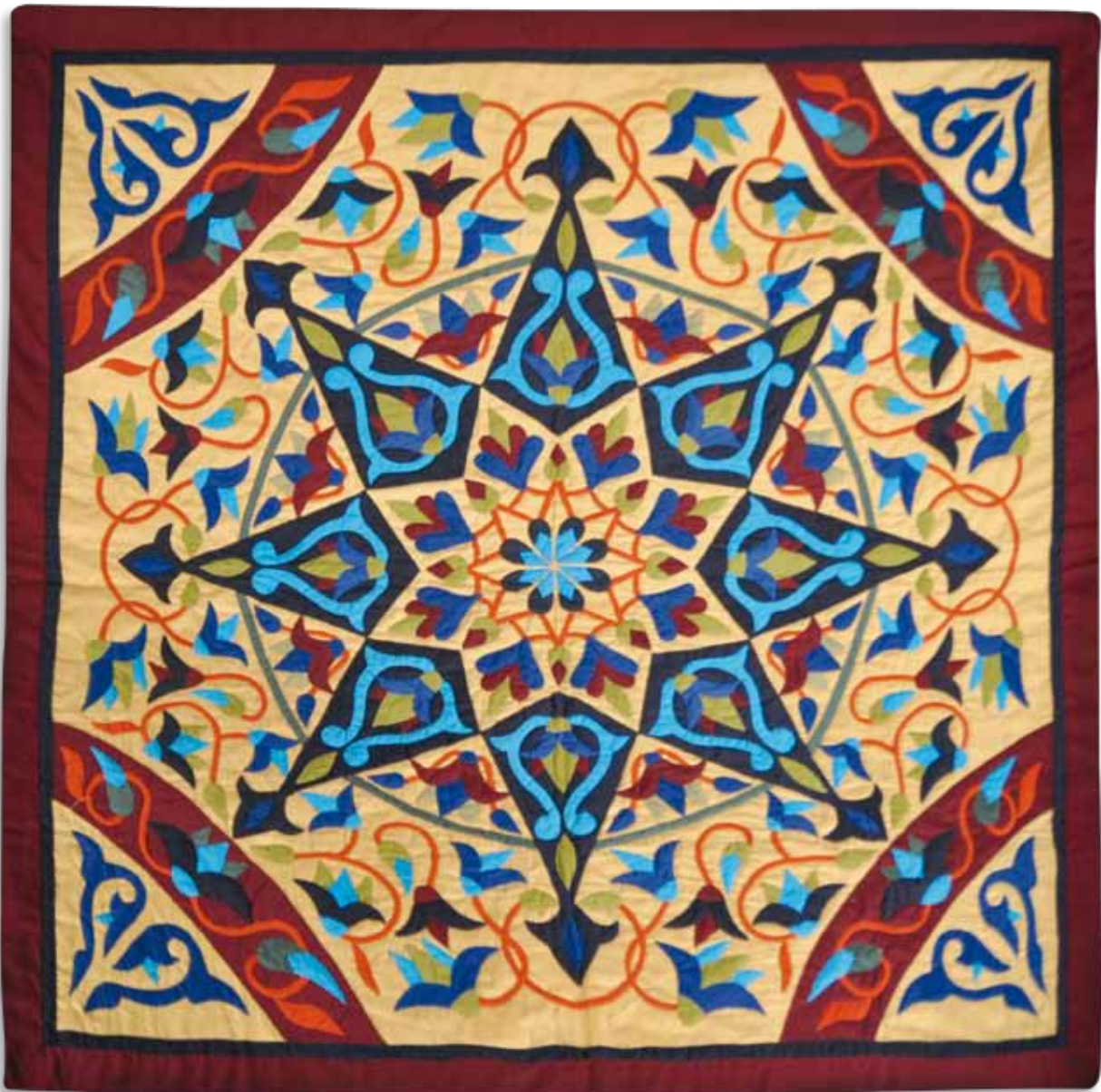
KHA110-15 Arabic wall hanging 110*110 cm – cotton face, linen back