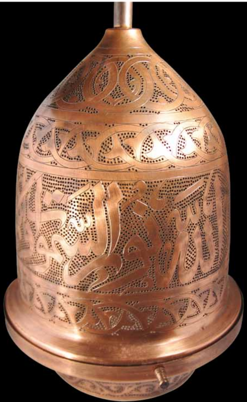
LC27 Ceiling lamp Islamic style Height: 60 cm width: 23 cm Copper