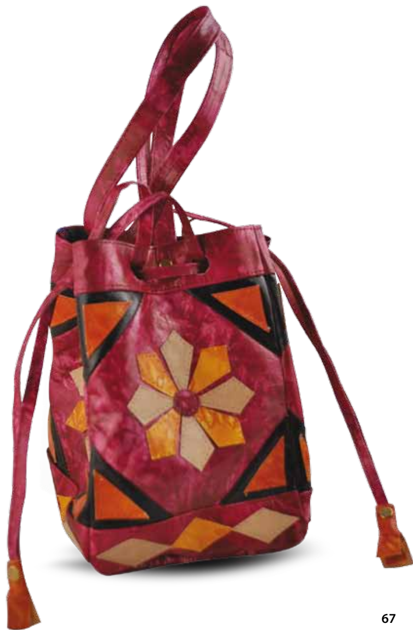
LTH-36L Ornamented leather bag Length: 15 cm Width: 10 cm Height: 20 cm