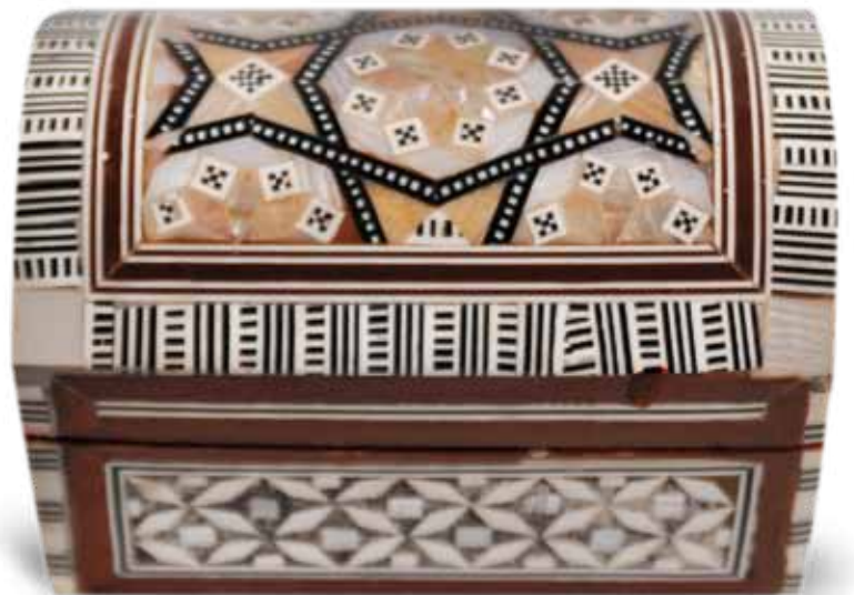
MOP- 39 C coffin box Width: 10.5 cm Cm: 7 cm Height: 4.5 cm Wood decorated with mother of pearl