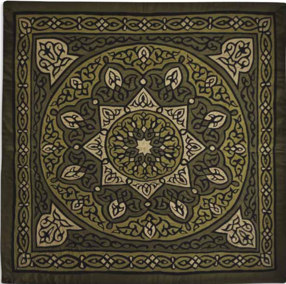
KHL110-19 Arabic wall hanging 110*110 cm – cotton face, linen back