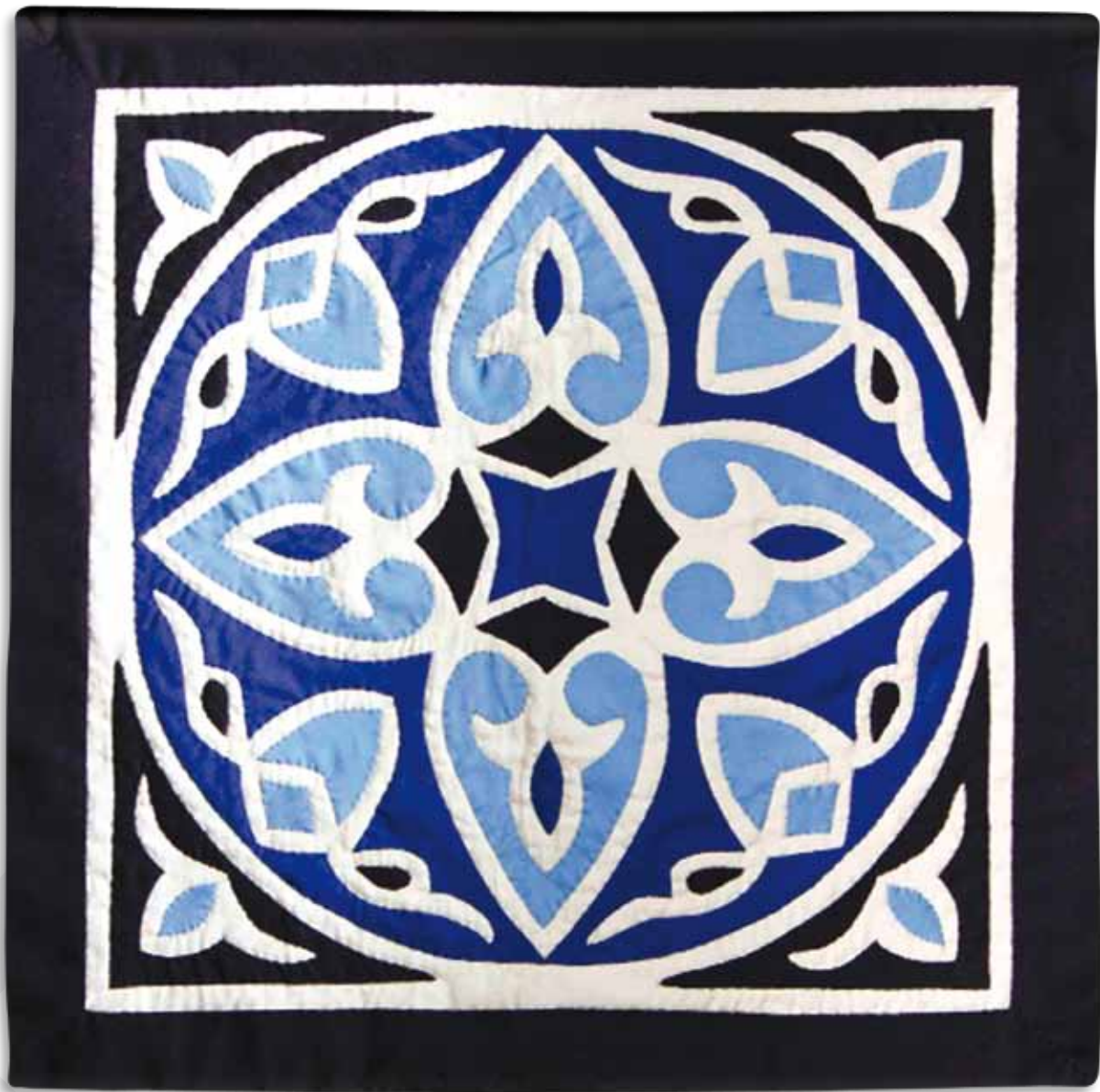
KHA45-8 Arabic cushion 45 * 45 cm - cotton