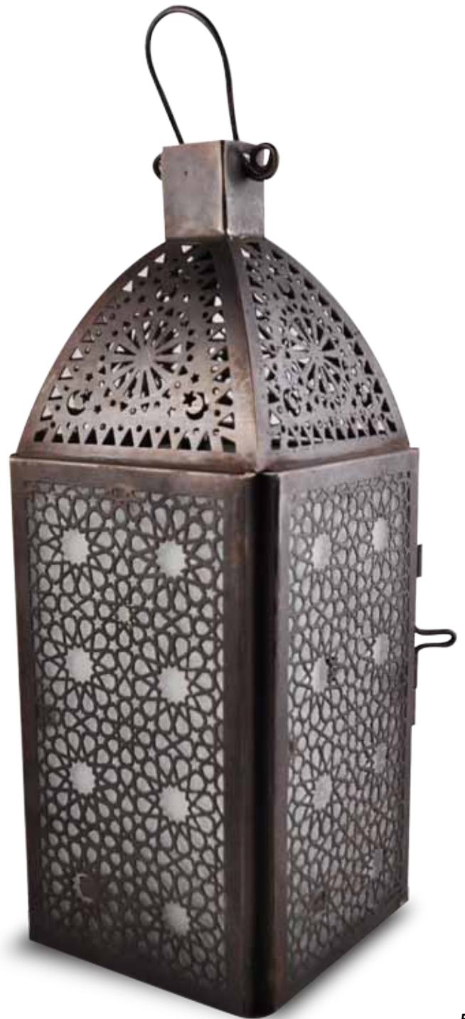
LT 55 Rectangle lantern Height: 27 cm Base width :7.5 cm Copper