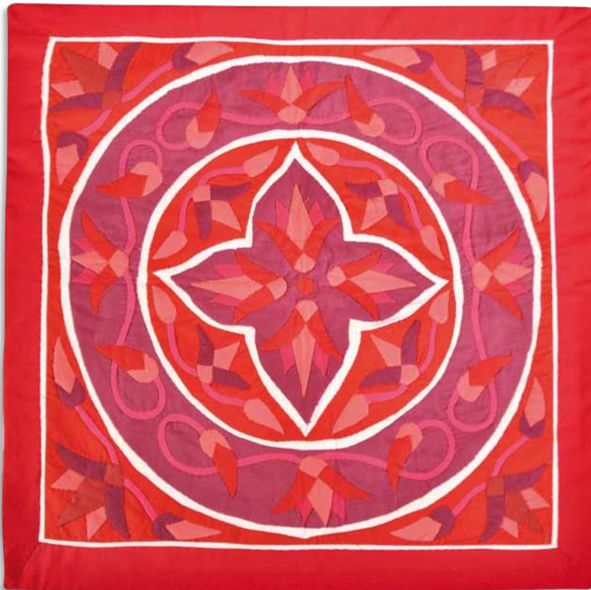
KHL90-13 Lotus wall hanging 90*90 cm – cotton face, linen back