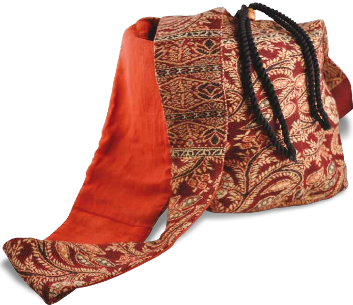
LB-23L Linen handmade bag 35*25 cm, Handle: 30 cm