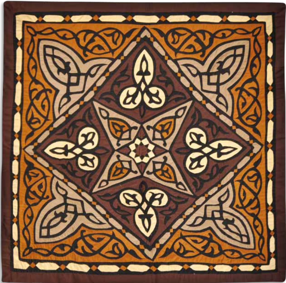
KHA110-17 Arabic wall hanging 110*110 cm – cotton face, linen back