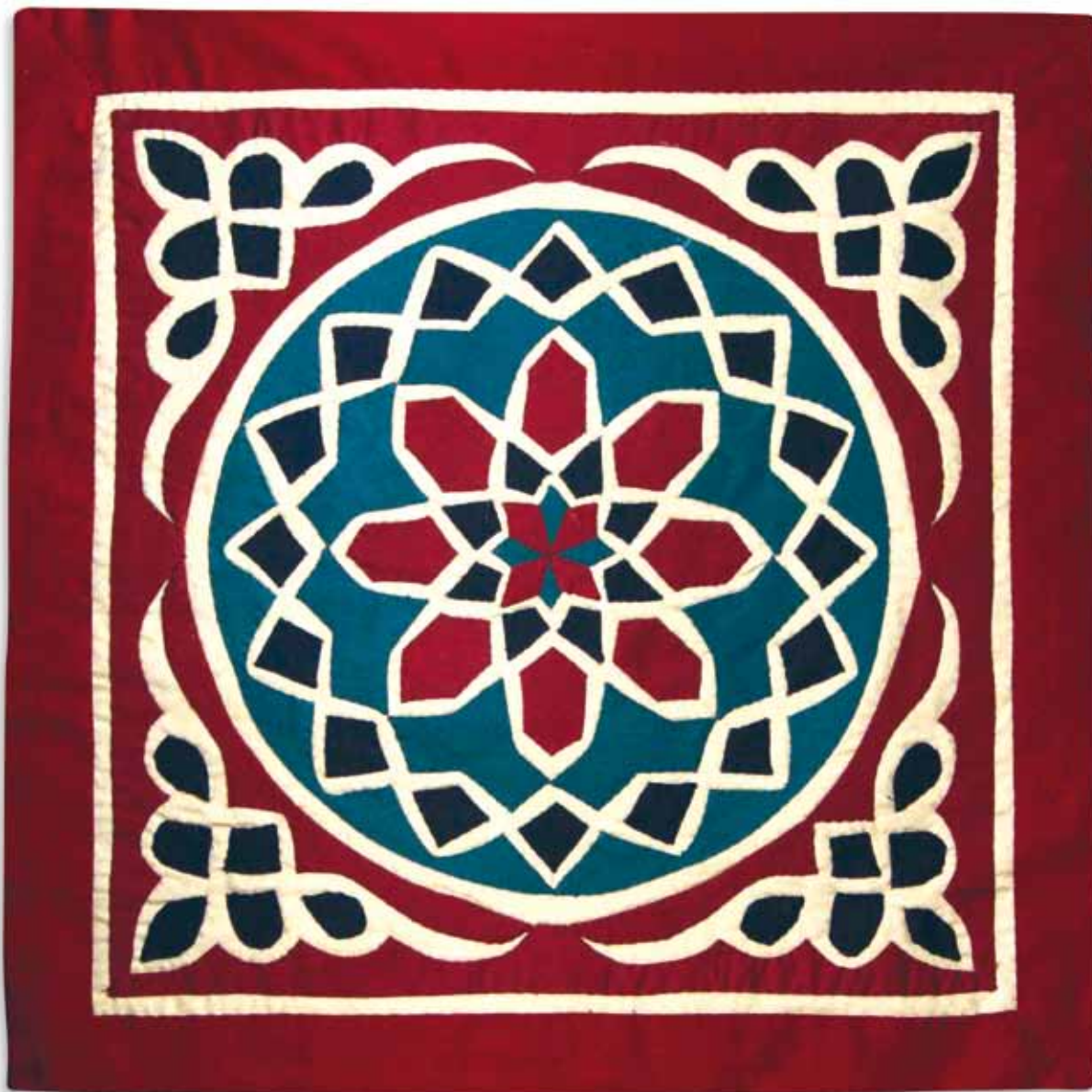
KHA90-12 Arabic cushion 45*45 cm – cotton