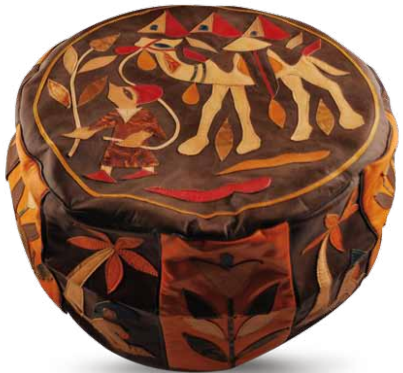
LTH-32R Leather floor cushion Diameter: 40 cm Height: 11 cm