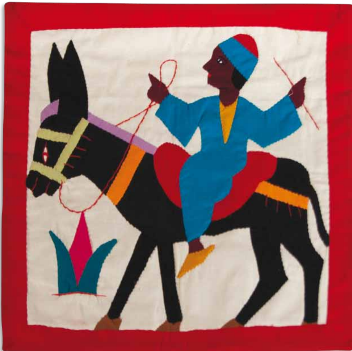
KHF110-16 Folklore wall hanging 110*110 cm – cotton face, linen back