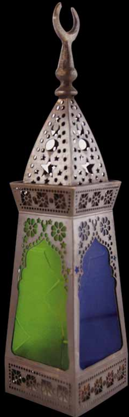
LT29 Tower lantern Height: 32 cm Base width: 8 cm Copper and glass