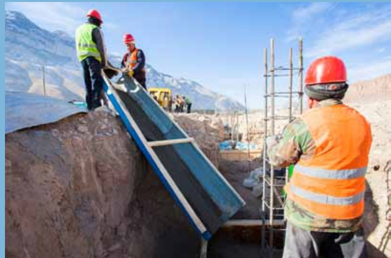
Pouring the foundations of the welfare facility.