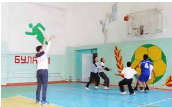
The UCA men's basketball team in action.

"Joining the Mayor's Sports Challenge made us feel connected to the Naryn community and many others from different organisations."