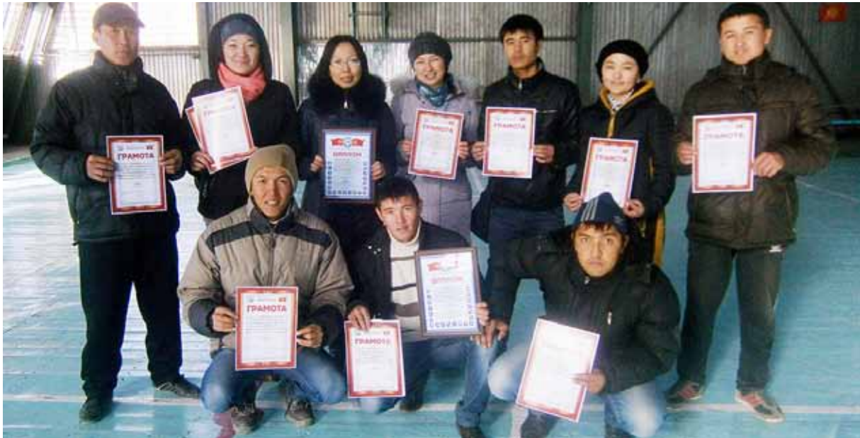
UCA teams with their certificates.

In October and November 2013, the Naryn Mayor's Office hosted its annual Mayor's Cup, a multi-sport challenge for local organisations. This was the first time University of Central Asia (UCA) teams placed in the top three in basketball and football.