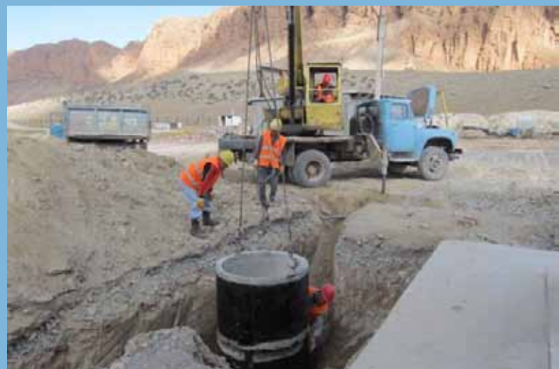
Installing culverts for the water supply system.