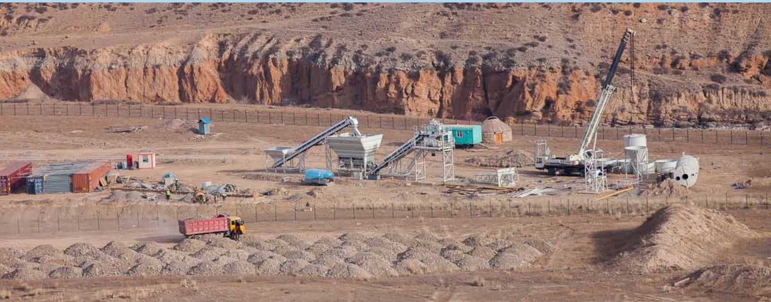
Construction of the concrete batching plant.