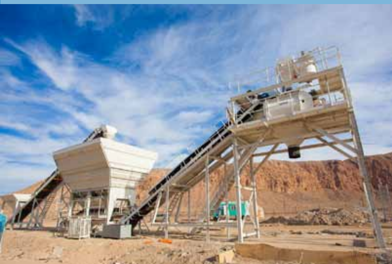
The batching plant, where concrete is mixed and manufactured.