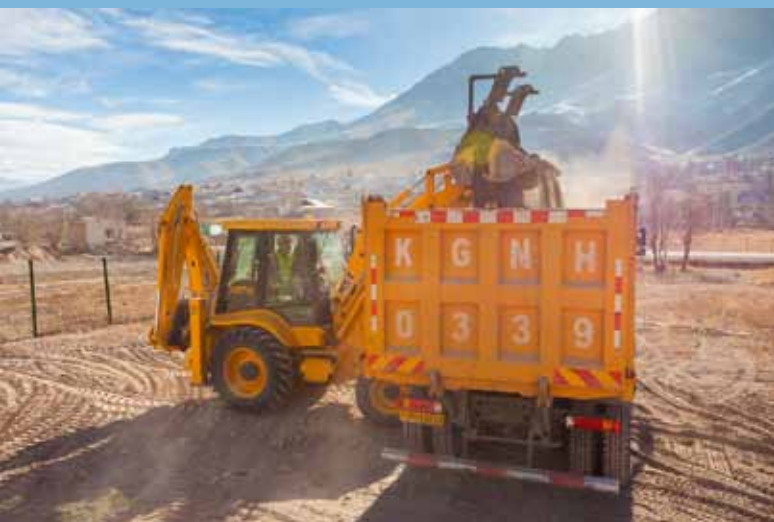
Backfilling the water supply system.