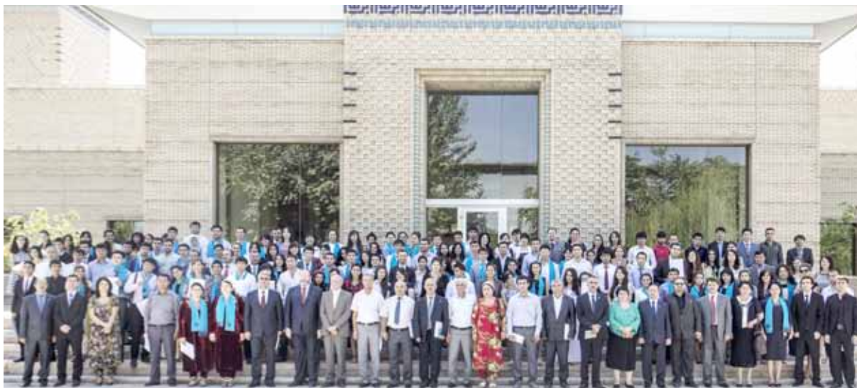
The 2013 SPCE and AKHP graduates after the ceremony in Dushanbe.

“UCA-SPCE gives its graduates the skills to excel and be the best in their profession. Even after graduation, this can be achieved through further cooperation with UCA-SPCE.”