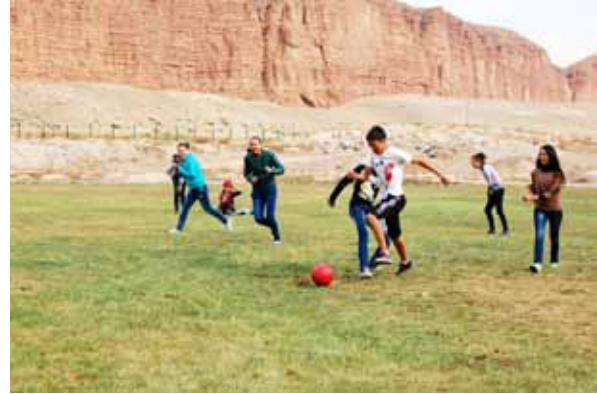
The visiting students enjoy the UCA soccer pitch.

point, which offers views of Naryn town and the UCA campus site. They then toured the construction site, and tried out their skills on UCA's world class tennis and soccer courts.