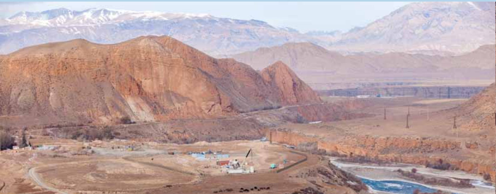
Panoramic view of the concrete batching plant and stone crusher location.