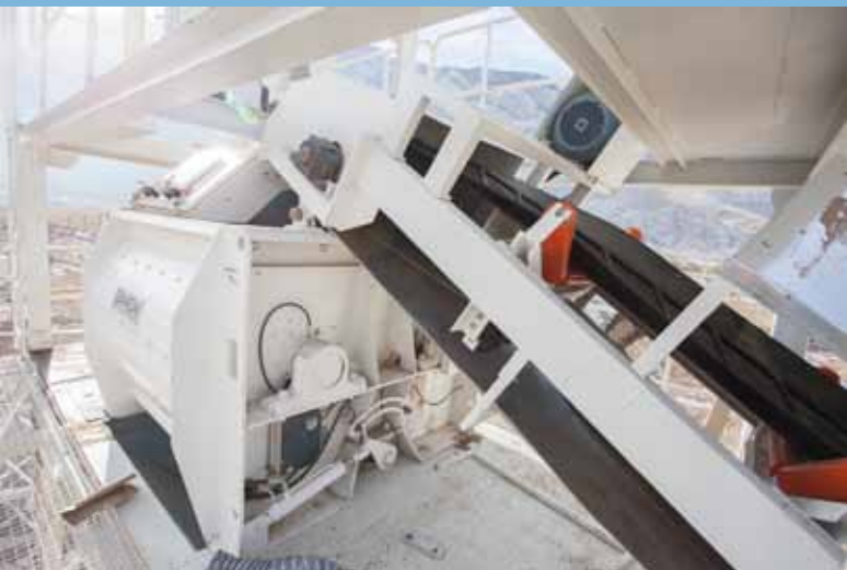
Inner workings of the batching plant.