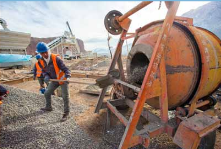
Mixing concrete for the foundations of the welfare facility, which will include food service, sanitary and health facilities for staff.