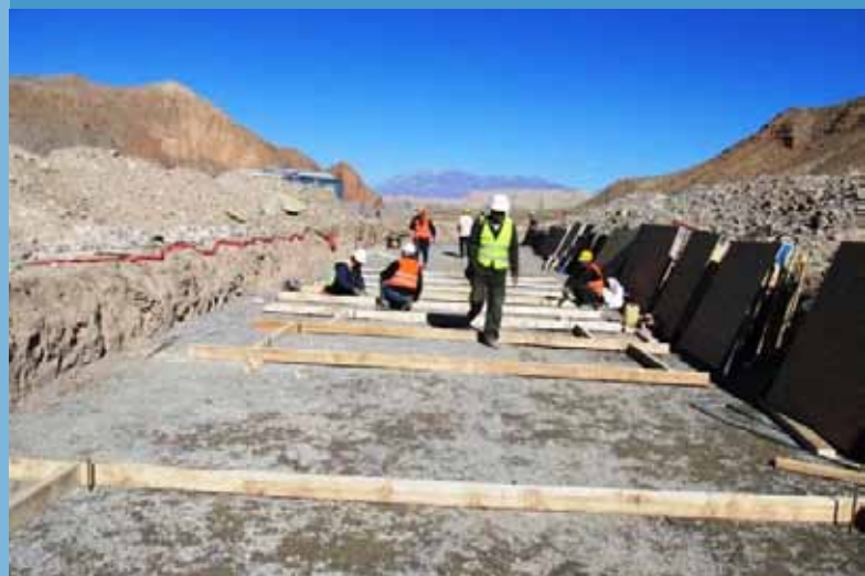
Installing formwork for pouring concrete foundations at the batching plant.