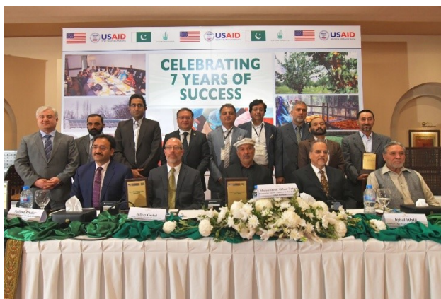
Officials from the Government of Gilgit-Baltistan, along with representatives from USAID and AKDN leadership, came together to celebrate the completion of SDP

The project also had an important impact on government policy: AKF, AKRSP, and government officials worked together to take lessons from SDP and apply them to Gilgit-Baltistan’s first-ever Agriculture and Livestock policies. Furthermore, the water management model pioneered under SDP led to the formulation of a Water Act and business plan for the region.