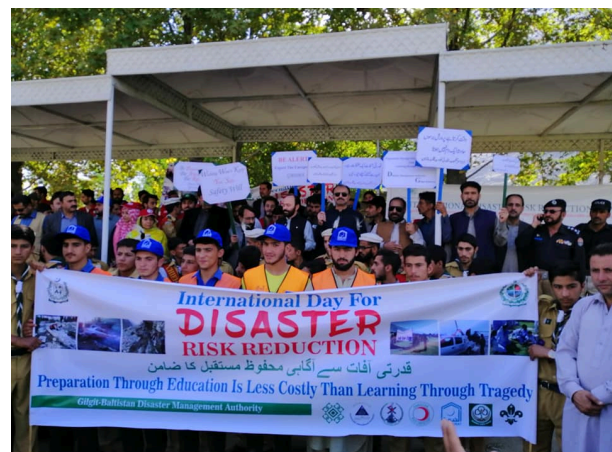
Representatives of government institutions, disaster management authorities and students holding play cards to highlight importance of DRR day

8 October 2018: The high frequency of natural disasters in Pakistan, particularly in the mountainous north, has displaced thousands of people, affected community livelihoods, and destroyed public and private infrastructure resulting in massive economic losses. To stress the importance of Disaster Risk Reduction (DRR), the Aga Khan Agency for Habitat, Pakistan (AKAH,P) celebrated DRR Week across Pakistan from 8th to 13th October 2018. The celebrations were aligned with Pakistan's National Disaster Awareness Day celebrated on 8th October, and the International Day for Disaster Reduction celebrated worldwide on 13th October.