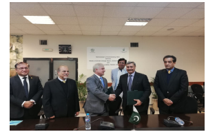
AKF(PAK) AND MINISTRY OF CLIMATE CHANGE SIGN MOU P.5