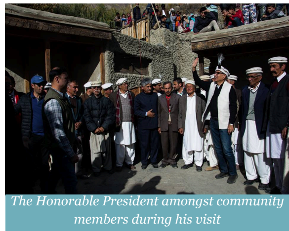
The Honorable President amongst community members during his visit

Community members, whilst interacting with the President, appreciated the efforts of AKCS-P and the role the Aga Khan Development Network has played in empowering the women of surrounding communities by engaging them in economic activities. The President was gifted various publications of the Aga Khan Trust for Culture and a locally made sitar (musical instrument). In his comments in the Altit Fort Visitors book, he wrote: "I enjoyed visiting the Altit Fort and am very impressed by the fact that the surroundings and houses have been restored so that our heritage is taken forward to next generations. Very impressed at the role of women in all activities. It is a pleasure to see a consciousness to preserve heritage and though I am concerned regarding development of tourism, I am sure it will be done in a responsible manner."