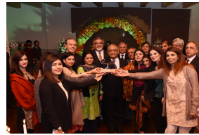
SERENA HOTEL WINS EMPLOYER OF CHOICE FOR GENDER BALANCE AWARD P.4