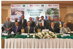
ACHIEVEMENTS OF SDP LAUDED AT CLOSING CEREMONY P.2