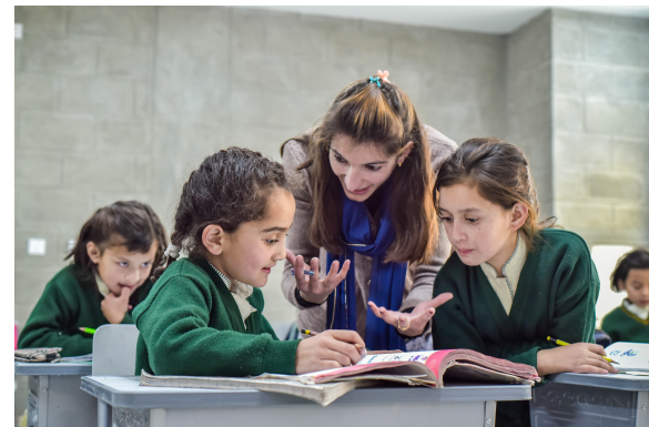
A teacher at AKS Murtaza Abad interacting with students