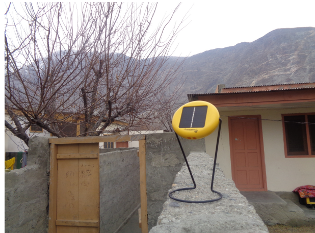
A portable solar pannel mounted in Ghizer to generate light

efforts under it’s internationally recognized Building and Construction Program (BACIP) which has provided energy efficiency products to more than 40,000 households over the last two decades. The project also builds on AKAH’s contribution in the installation of a 400 kilowatt solar plant in the recently constructed Bamyán Provincial Hospital in Afghanistan. Moving forward, AKAH,P aims to continue its efforts in promoting solar energy products as a viable energy solution, and lighting up the lives of low-income households across Pakistan.