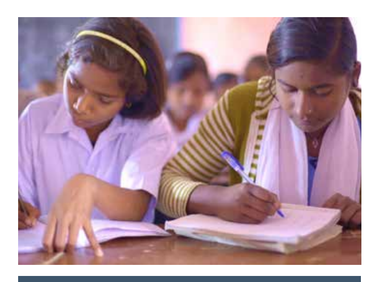
Girls are supported to re-start their education.