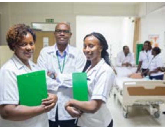
Above: The first class of AKU oncology nursing students in Nairobi. They are also East Africa's first cancer nurses.

Alongside its healthcare facilities, the AKDN works with research institutions in the developed world and undertakes research focused on endemic problems. Its healthcare institutions have published in many of the most respected journals in medicine on topics ranging from malaria to heart disease.