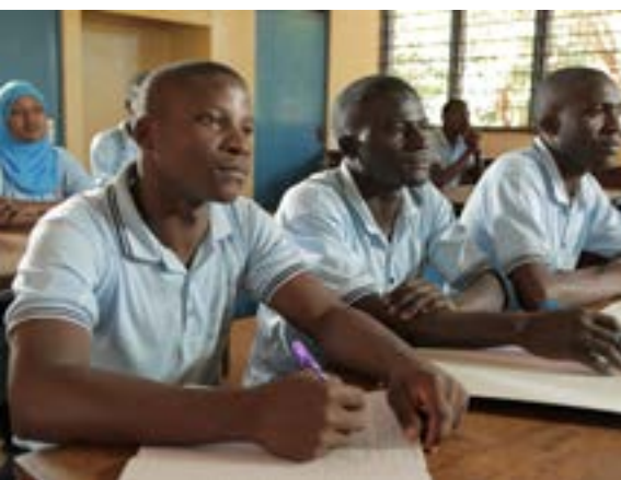
Above: Nachingwea Teacher Training College in Tanzania: AKU-IED strives to enhance the quality of education by raising the standards for teacher education.

With over 80 clinics across East Africa, these facilities provide a comprehensive range of high-quality clinical services, both preventive and curative, in rural and urban contexts. They also set the standard for comprehensive healthcare and modern medical education and research in East Africa.