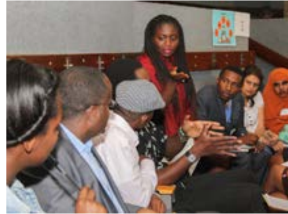
Above: The East African Institute focuses on five key themes: Integration and regional food security; trans-boundary biodiversity and ecosystems; integration and education; population health and human development; and creative economy.

The Aga Khan University’s Graduate School of Media and Communications (GSMC) offers working journalists and communications professionals in East Africa the chance to learn from practitioners from some of the world’s leading media and communications organisations.