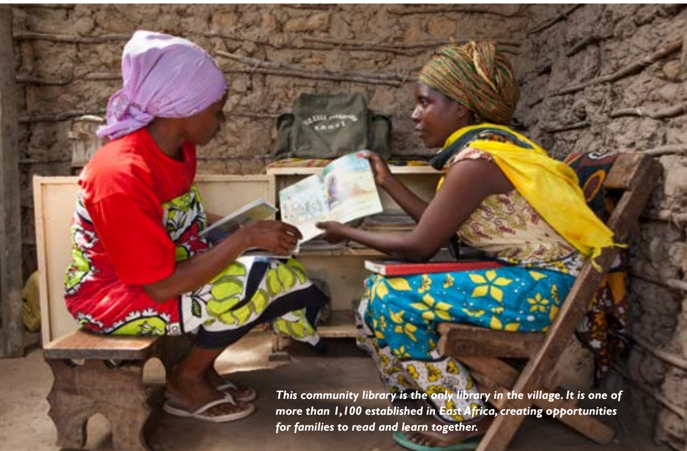
This community library is the only library in the village. It is one of more than 1,100 established in East Africa, creating opportunities for families to read and learn together.