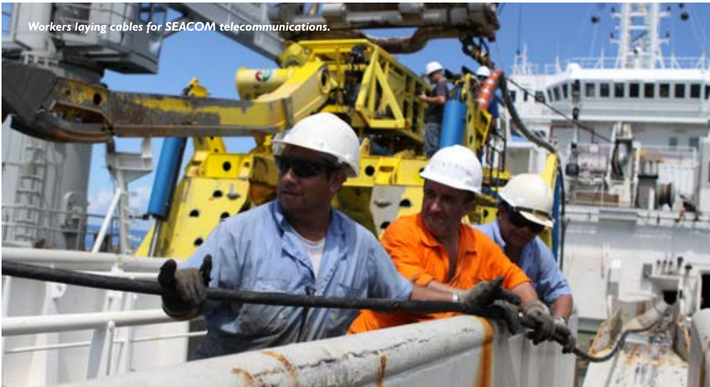
Workers laying cables for SEACOM telecommunications.