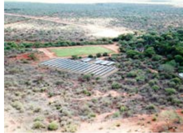
Above: Aerial view of solar arrays at the Kilaguni Serena Safari Lodge, Kenya's first fully solar powered lodge. Serena Hotels is committed to replicating this model at its other properties in Africa, to help reduce its carbon footprint and contribute positively to climate change mitigation.

One example of AKDN action at a local level is an initiative by Jubilee Insurance, which has committed funding to the Maasai Wilderness Conservation Trust in Kajiado. This initiative supports community efforts in Conservation, Education and Health Services. The sponsorship is channelled through bursaries, scholarships, and construction of primary school classrooms as well as the purchase of an ultrasound machine for the community health centre in order to improve maternal health care.