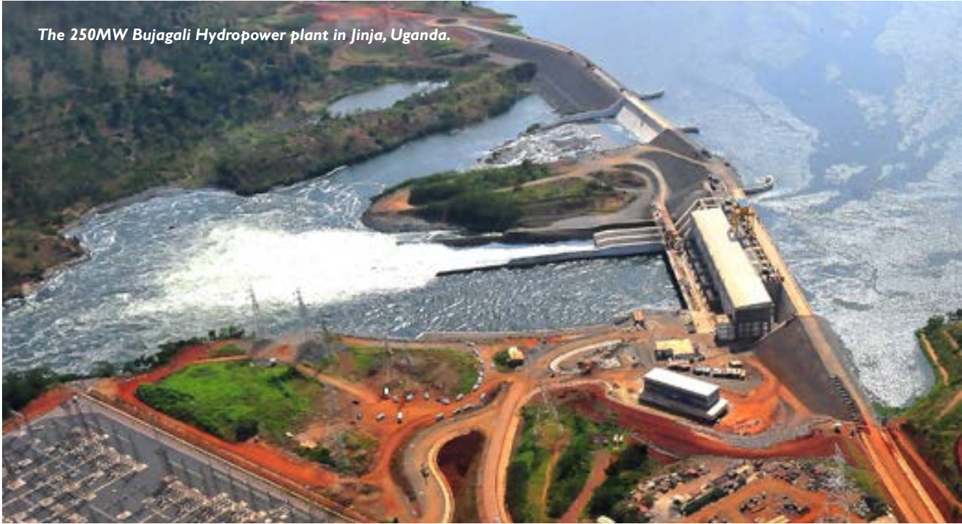
The 250MW Bujagali Hydropower plant in Jinja, Uganda.