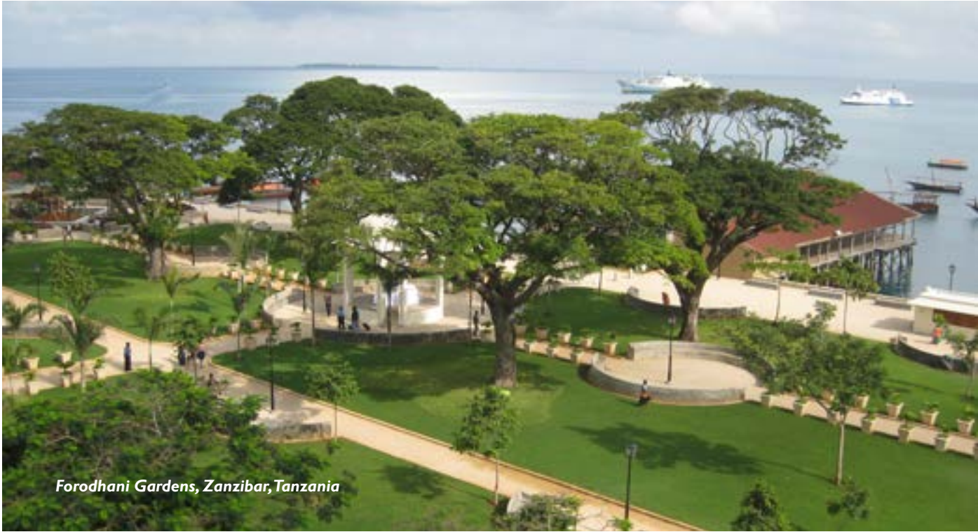
Forodhani Gardens, Zanzibar, Tanzania