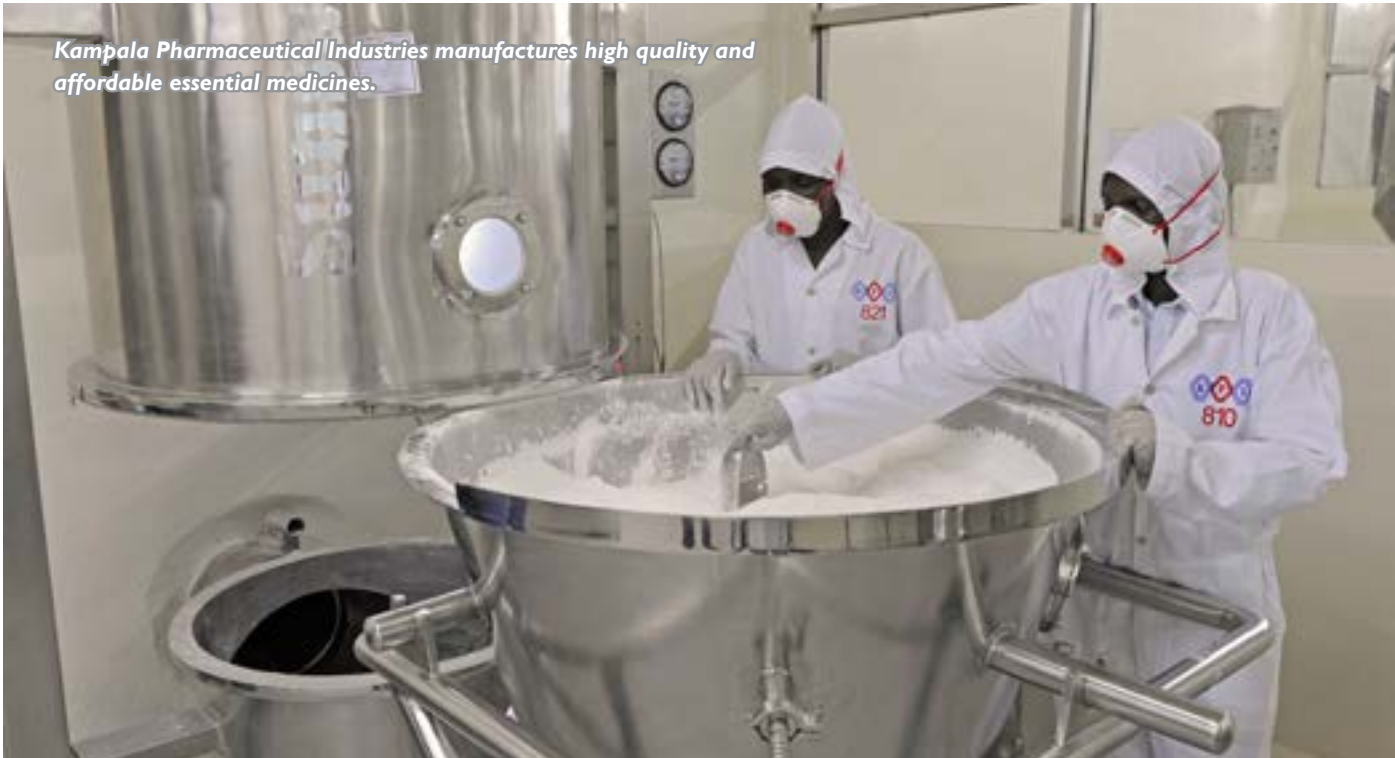
Kampala Pharmaceutical Industries manufactures high quality and affordable essential medicines.