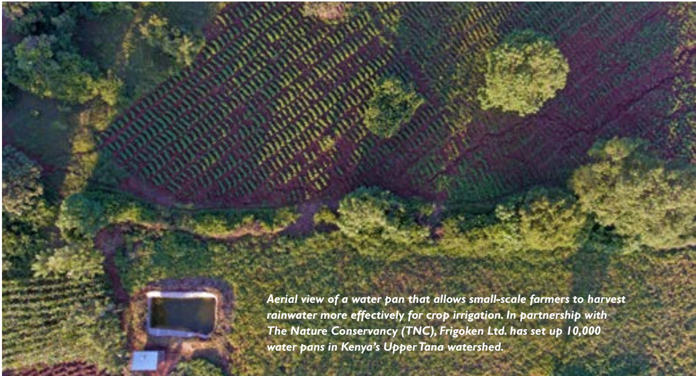
Aerial view of a water pan that allows small-scale farmers to harvest rainwater more effectively for crop irrigation. In partnership with The Nature Conservancy (TNC), Frigoken Ltd. has set up 10,000 water pans in Kenya's Upper Tana watershed.