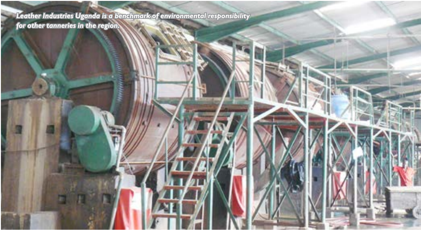
Leather Industries Uganda is a benchmark of environmental responsibility for other tanneries in the region.