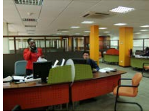
Above: With Jubilee Insurance coverage, farmers are protected against the loss of crops due to natural disasters, uncontrollable pests and theft.

One example of AKDN's Rural Support programming in East Africa has been the Coastal Rural Support Programme . Designed to address the needs of rural communities, the Programme recognises that families in these areas often live beyond the reach of public services and are constrained by the forces of nature, such as a lack of clean water, weak village infrastructures and limited access to education and health care.