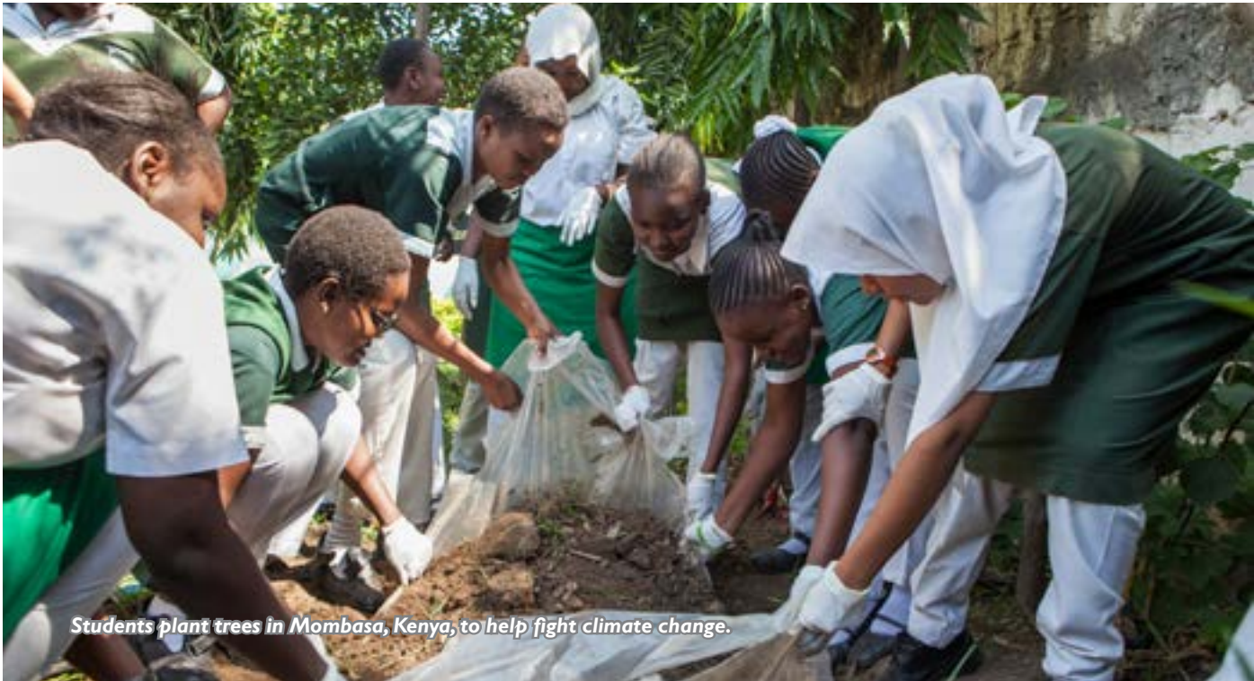
Students plant trees in Mombasa, Kenya, to help fight climate change.