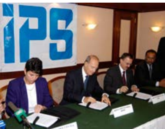
Above: Prince Ayn Aga Khan (centre) signed a partnership agreement in 2003 at a ceremony in Nairobi to announce a capital increase of US$ 32.4 million in IPS for investments in East Africa. Below: TLL Printing and Packaging is one of the largest printing and packaging companies in Tanzania.

Other activities to develop the region's industrial base include investments in printing and packaging facilities, fishnet manufacturing and food processing.