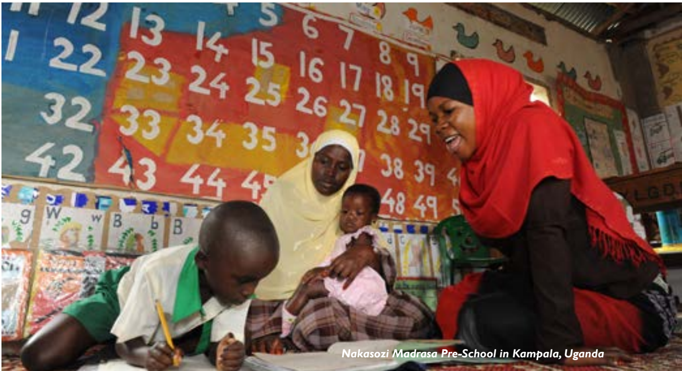
Nakasozi Madrasa Pre-School in Kampala, Uganda