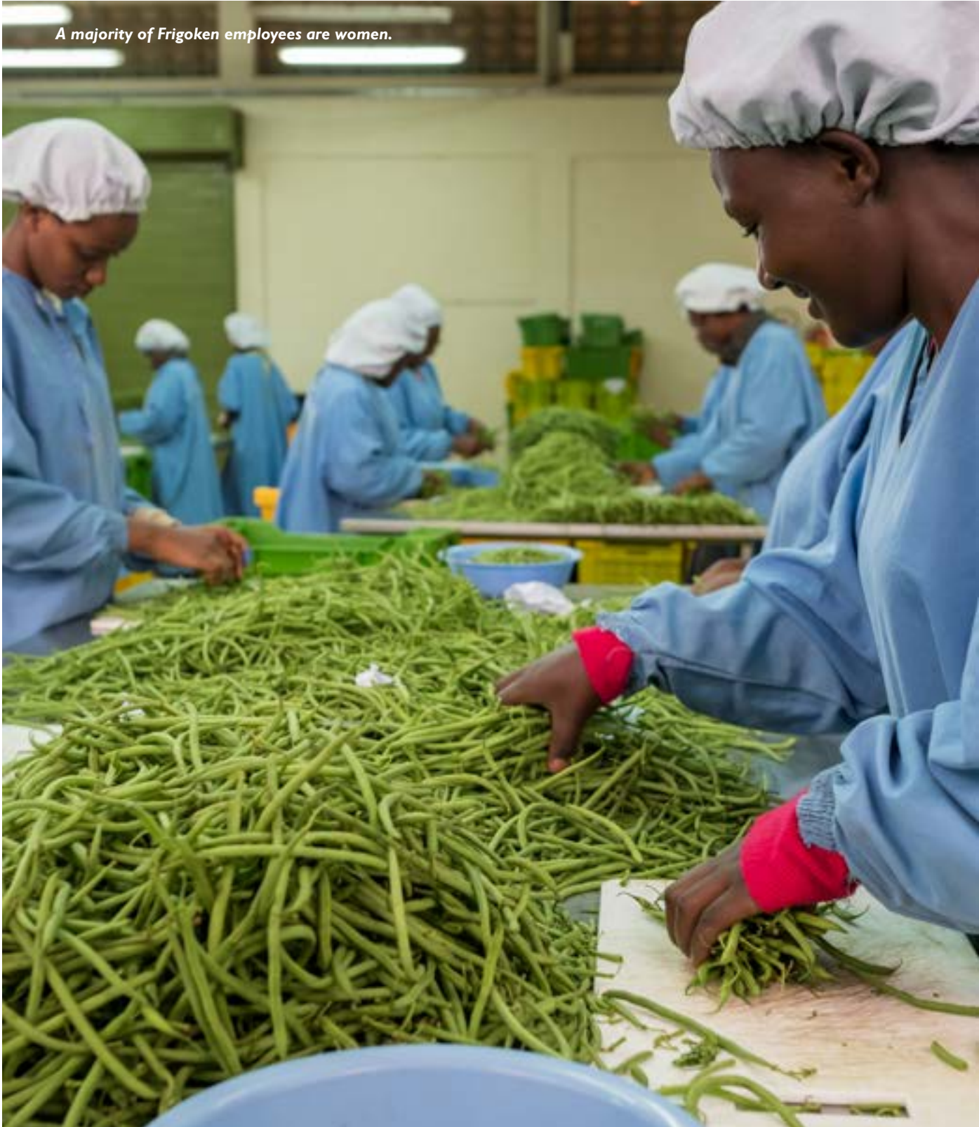
A majority of Frigoken employees are women.