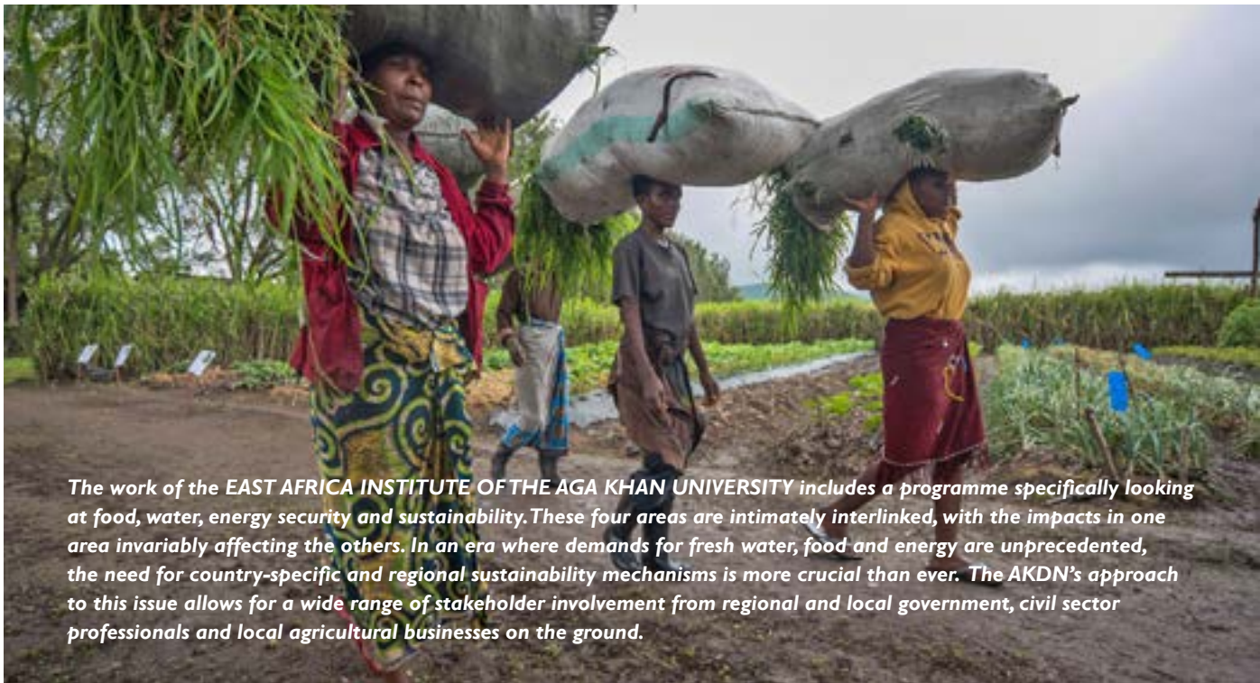
The work of the EAST AFRICA INSTITUTE OF THE AGA KHAN UNIVERSITY includes a programme specifically looking at food, water, energy security and sustainability. These four areas are intimately interlinked, with the impacts in one area invariably affecting the others. In an era where demands for fresh water, food and energy are unprecedented, the need for country-specific and regional sustainability mechanisms is more crucial than ever. The AKDN's approach to this issue allows for a wide range of stakeholder involvement from regional and local government, civil sector professionals and local agricultural businesses on the ground.