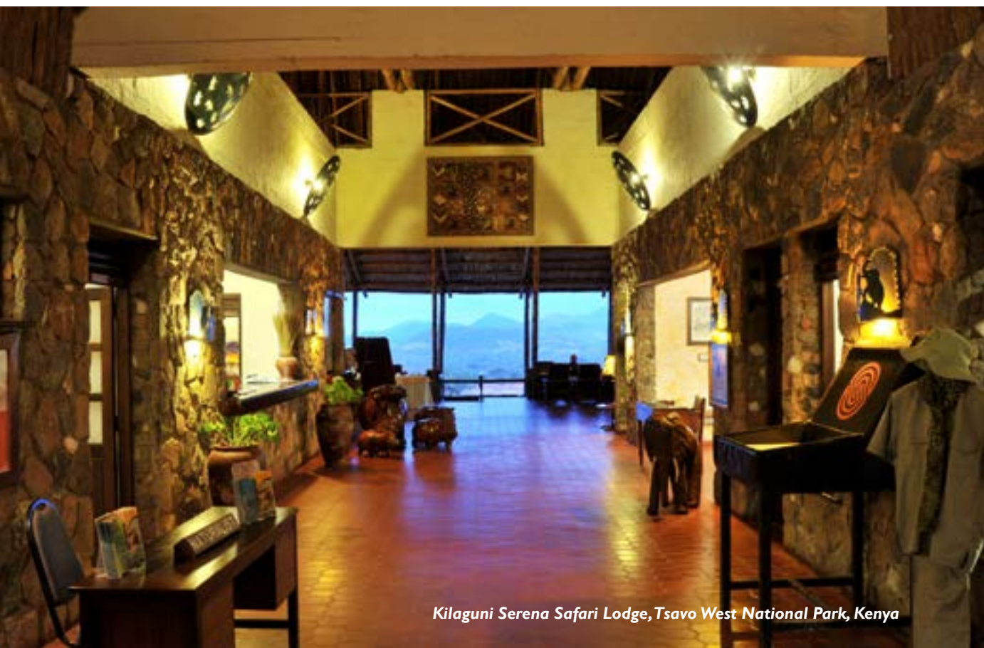
Kilaguni Serena Safari Lodge, Tsavo West National Park, Kenya