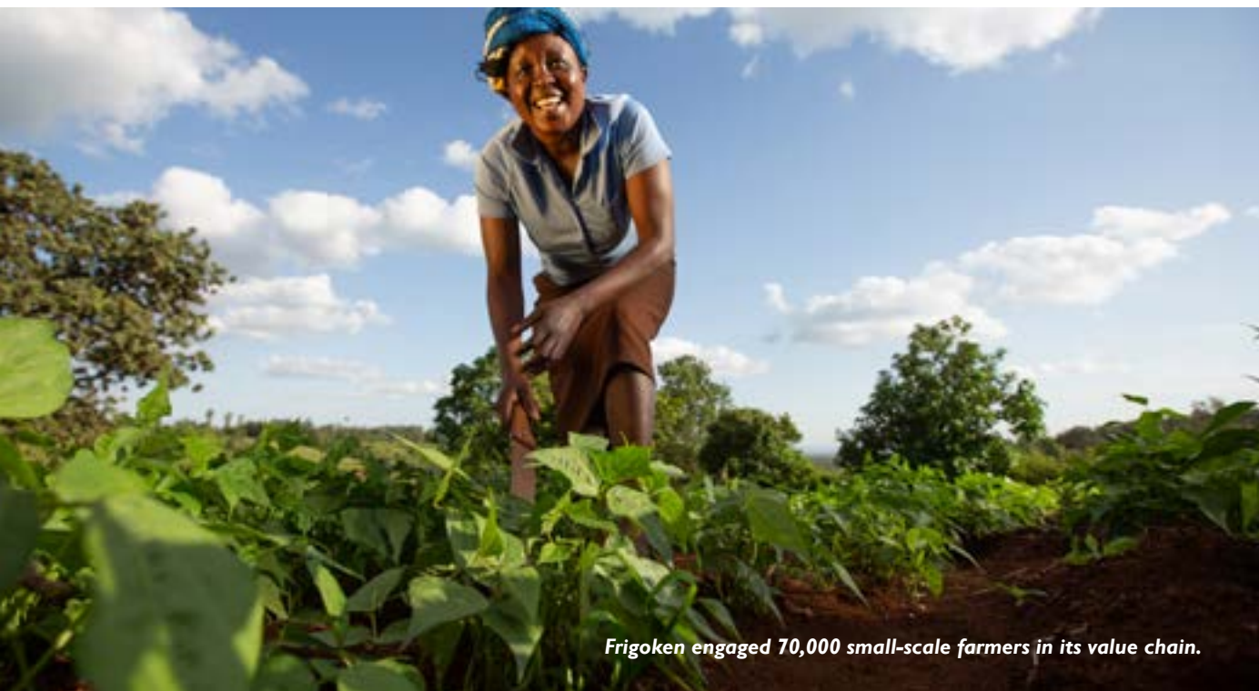
Frigoken engaged 70,000 small-scale farmers in its value chain.

Conforms to the Global GAP standard of Good Agricultural Practices