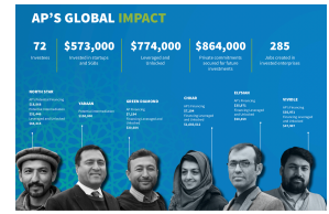
ACCELERATE PROSPERITY: AKDN'S ENTERPRISE GROWTH ACCELERATOR P.5