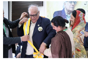
AKRSP AND AKF(PAK) ORGANIZE AN LSO CONVENTION IN GILGIT P.3