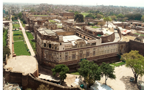
Restored western facade of the Picture Wall of Lahore Fort