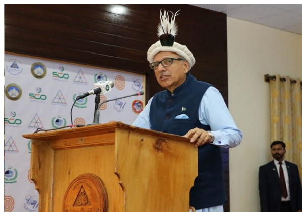
The Hon. President addressing the audience at the conference

China Pakistan Economic Corridor and Eco-Tourism workshops were the main focus but exhibitions on travel, tourism and hospitality were also part of the three-day event along with an excursion tour to Khunjerab Pass.