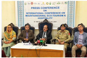
PRESIDENT OF PAKISTAN SPEAKS AT A CONFERENCE ORGANIZED BY SERENA HOTELS P.2