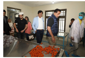
ADVISOR TO PRIME MINISTER APPRECIATES AKDN ON A VISIT TO PROJECT SITES P.4