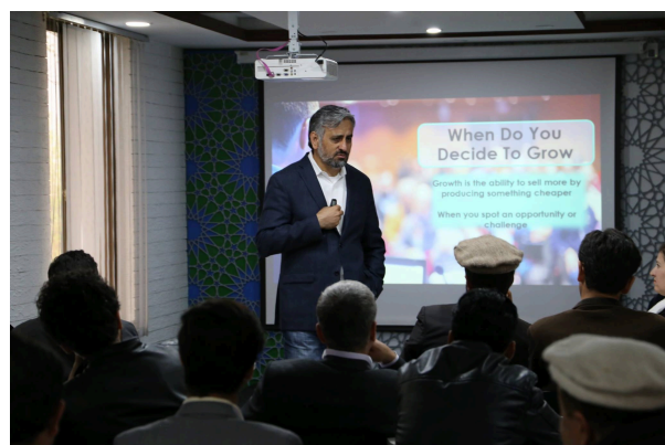
Session on value-investing for AP supported businesses by Arif Habib Group and Silk Bank Investments

In the two years since inception, AP Pakistan has engaged 12,434 entrepreneurs, and provided select startups and existing businesses relevant trainings and business advisory. It has incubated 97 startups and provided financing-readiness services to 41 existing businesses. AP Pakistan has provided direct finance and intermediated external investments for 29 businesses and leveraged its finance to unlock four times its investments for these businesses from business owners and the private sector. It has also facilitated more than PKR 50 million worth of external financing commitments for these businesses. AP Pakistan's support has enabled these businesses to create 172 new jobs and improve 2,350 existing jobs. AP Pakistan supported businesses have experienced an average year on year increase in revenues of around 18.5%. Over the next five to seven years, AP Pakistan intends to engage around 15,000 entrepreneurs, provide training and business advisory to around 900 businesses, and extend financing or intermediate investments to around 300 businesses across Pakistan.