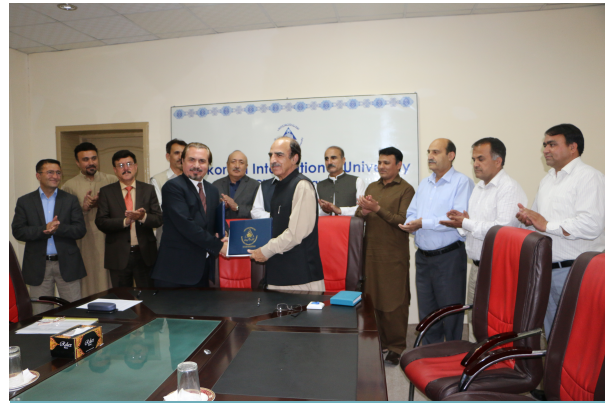
Exchange of MOUs between AKAH,P and KIU at the signing ceremony

adaptation, will make us achieve the goals of reducing disaster vulnerability and improve built environment. This partnership with KIU, the leading academic institution in Gilgit-Baltistan, will assist our teams in conducting research studies that will contribute for innovation as well as value addition to the existing indigenous knowledge, for disaster management and building safer habitats.” In the past AKAH,P and KIU have worked on the assessment of selected glaciers and the development of skilled craftsmanship in Gilgit-Baltistan through joint programs.