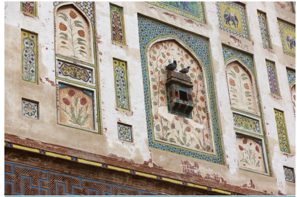
Closeup of the features of the restored western facade of the Picture Wall

which is exquisitely decorated, forms the original private entrance to the Fort and is one of the largest murals in the world. The conservation of the 240-foot-long western facade has been carried out by the Aga Khan Trust for Culture (AKTC), and its country affiliate, the Aga Khan Cultural Service-Pakistan (AKCS-P), in collaboration with the Walled City of Lahore Authority (WCLA). The restoration of the wall, which was initiated in 2017, was supported with funding from the Royal Norwegian Embassy, the Government of Punjab, the Federal Republic of Germany and AKTC.