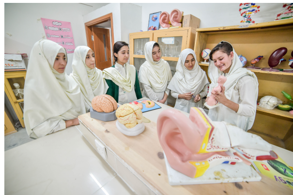
AKES,P students during a group exercise in a lab