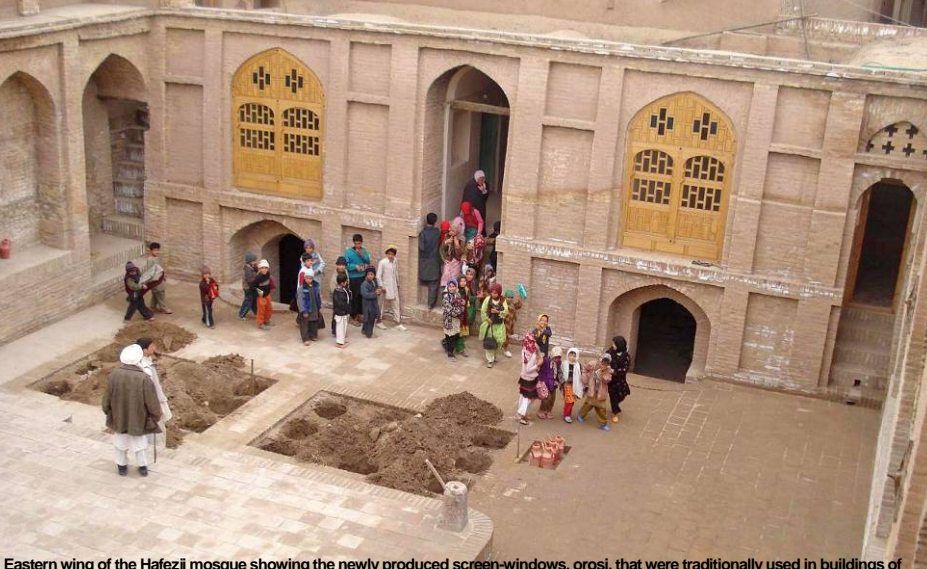
Eastern wing of the Hafezji mosque showing the newly produced screen-windows, orosi, that were traditionally used in buildings this era in the old city. In the courtyard preparations are being made for spring planting.

Moreover, the project has contributed to the development of skills among Afghan craftsmen and professionals, while promoting an understanding of the value of traditional construction techniques, in a context where these are under increasing threat.