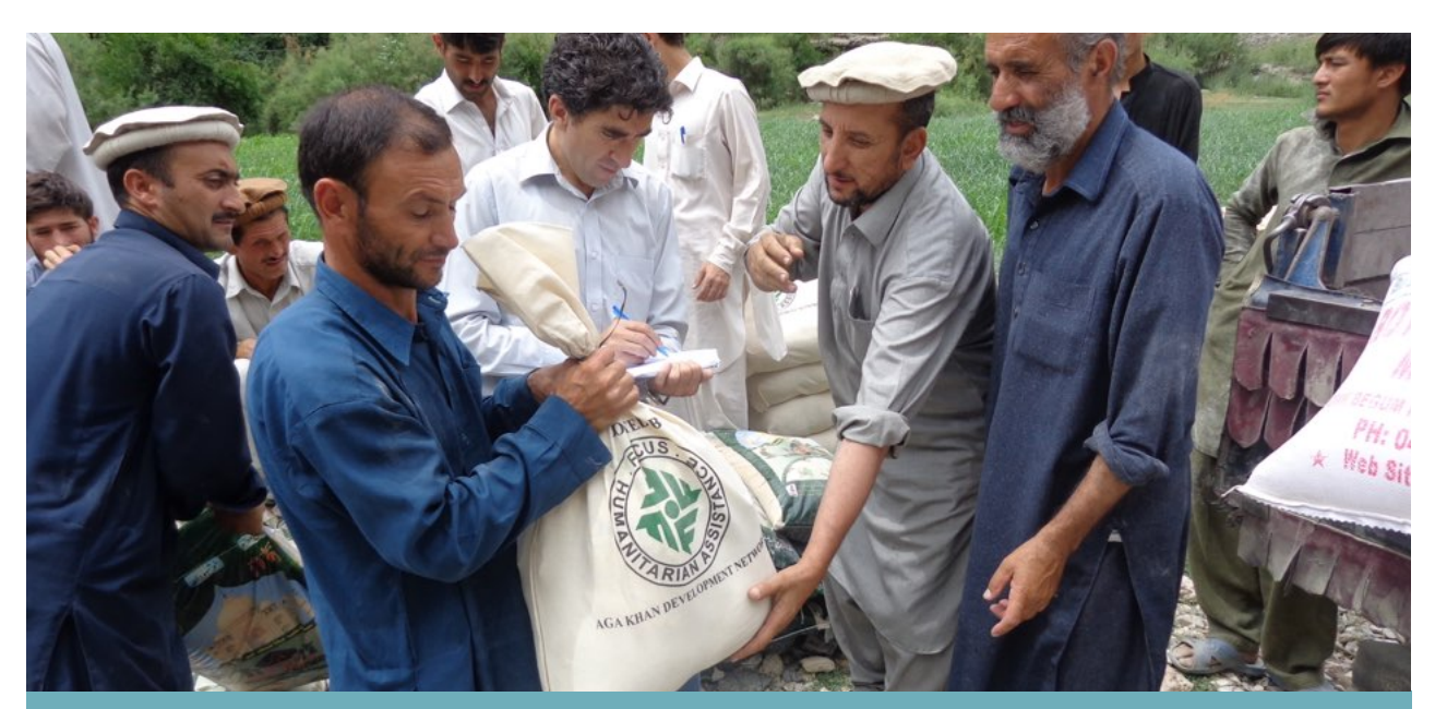
FOCUS volunteers arriving with aid for communities stuck in flood affected valleys in Chitral with no road access

July 2015: Chitral, the largest district of Khyber Pukhtunkhwa was affected by a series of natural disasters. Within 20 days more than 100 flash floods, debris flows and GLOF affected more than 100 villages killing 32 people, damaging 80% of the infrastructure, internally displacing more than 10,000 people and stranded a further 300,000 people. Focus Humanitarian Assistance (FOCUS) Pakistan predicted the situation well in time and early warnings were already given to vulnerable communities through announcements and community education. Early warnings