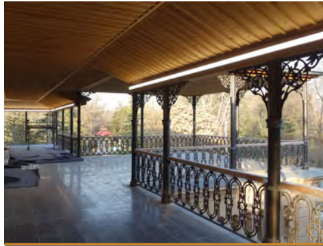
External balcony, after restoration, 2016