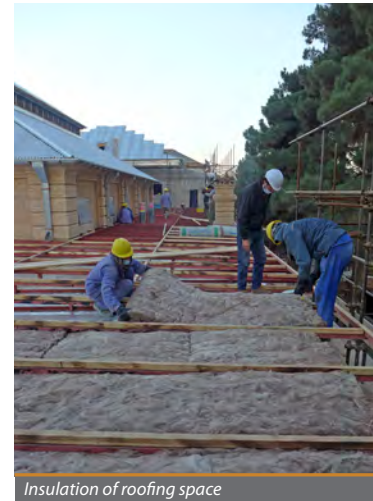
Insulation of roofing space