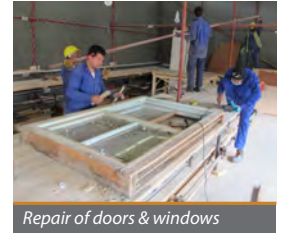
Repair of doors & windows