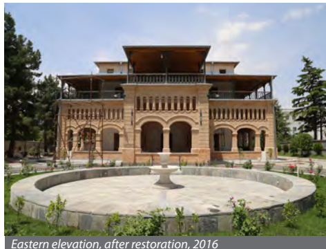
Eastern elevation, after restoration, 2016