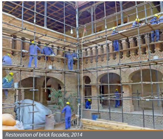
Restoration of brick facades, 2014