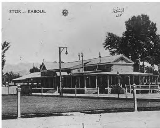
Nineteenth Century Garden Pavilion