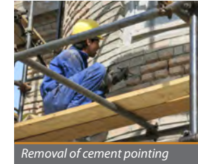
Removal of cement pointing