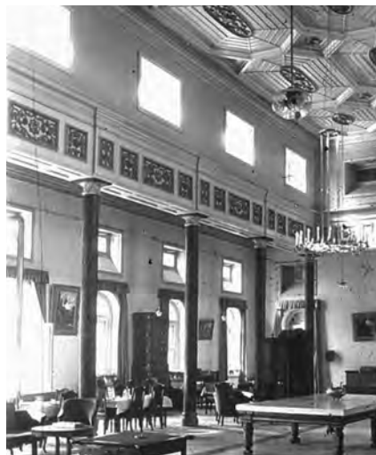
Large gathering hall built to the west of Pavilion

Originally built as a high single-story pavilion with lower openings covered by a deep-set arcade built around the perimeter of the building and clear-story windows located higher up in the walls to allow natural light to enter directly into internal spaces, the first extension of the pavilion is thought to have been to the east with the construction of a two-story brick masonry building with an arcaded portico and large terrace in 1912 during the reign of Habibullah Khan (1905-1919). A second extension, the large gathering hall to the west, is thought to have been added in 1915 to designs complementing the earlier addition on the opposite end of the building.