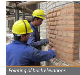
Pointing of brick elevations