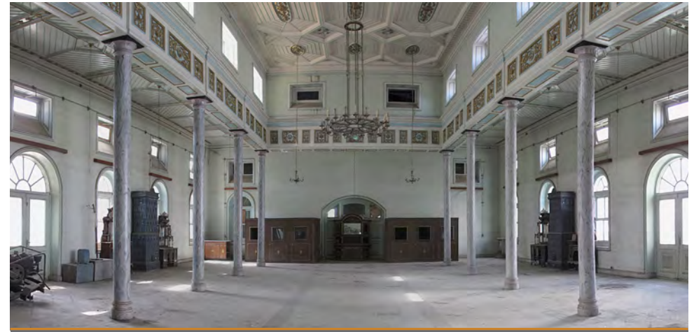
Main Gathering Hall, before restoration, 2013