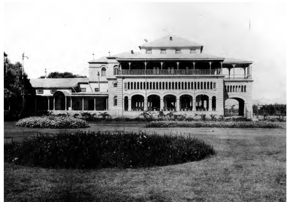
Two storey structure constructed to the east of the Pavilion

Later expansion works conformed to the brick architecture of the Palace by adding two circular "turrets" to the western limits of the building and a second-story, built above the remains of the late 19th century structure, thereby completely "encasing" the garden pavilion within later additions. Materials used for this third major intervention were recycled from other structures as brick sizes varied and wooden beams and coverings were found to be remnants of door frames and panels.