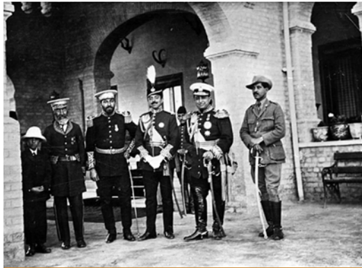
King Amanullah (Centre) with members of the Royal family

The Palace housed offices of the Ministry of Foreign Affairs until 1965, when most functions were re-located to a modern marble-clad building constructed to the east.