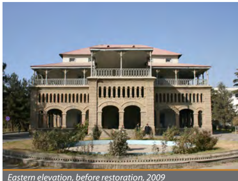
Eastern elevation, before restoration, 2009