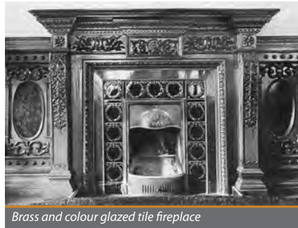
Brass and colour glazed tile fireplace