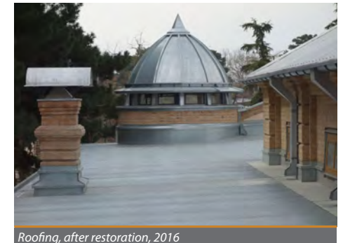
Roofing, after restoration, 2016