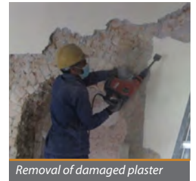
Removal of damaged plaster