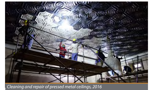
Cleaning and repair of pressed metal ceilings, 2016