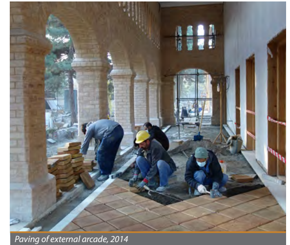
Paving of external arcade, 2014