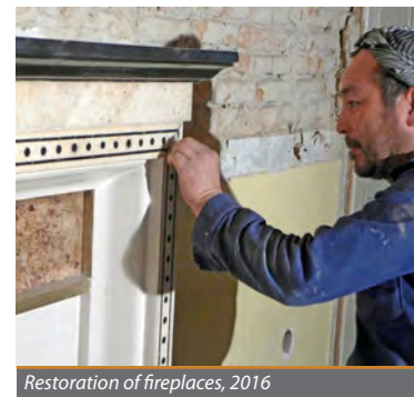
Restoration of fireplaces, 2016