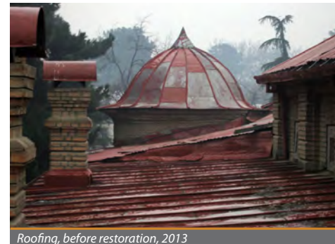
Roofing, before restoration, 2013