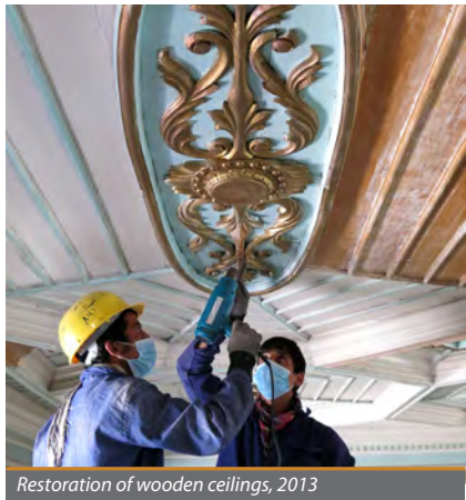
Restoration of wooden ceilings, 2013

Preliminary building surveys and assessments were carried out from 2009-11, and a tri-partite agreement was formulated between the Governments of Afghanistan and India and the Aga Khan Development Network, providing a framework for the comprehensive rehabilitation and restoration of the building carried out by the Aga Khan Trust for Culture between 2013-2016.