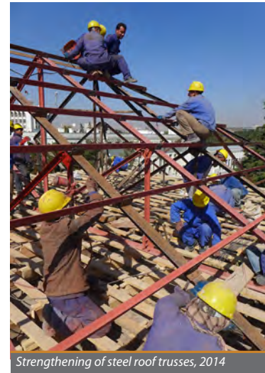
Strengthening of steel roof trusses, 2014