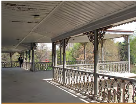
External balcony, before restoration, 2011

Following the preparation of a comprehensive physical survey, which entailed undertaking building archaeology, and the finalization of a detailed conservation design, rehabilitation works carried out included the reconstruction of the roof of the palace, structural consolidation and reinforcement works, the re-pointing of all external elevations, extensive restoration of internal finishes including cast & pressed metal features, wooden ceilings, plaster and marble decorations, the provision of state-of-the-art mechanical heating, electrical and plumbing services, and the complete landscaping of the immediate area around the Palace.